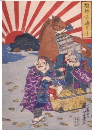
An ukiyoe print, Lucky gods Visit Enoshima Palace , by Yoshiiku Ochiai, 1869