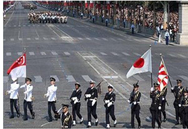
A parade in Paris in 2018

(a Maritime Self-Defense Force vessel entering in Tsingtao port)