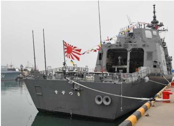
Naval event in Tsingtao 2019

For more than half a century, these flags have been playing an indispensable role to show the presence of the Self-Defense Forces vessels and units, and are widely accepted in the international community.