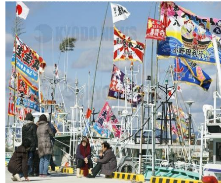
The return to Ukedo port (2017) of fishing boats that had evacuated due to the Great East Japan Earthquake