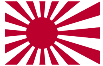
The flag of the Maritime Self-Defense Force

The flags of the Maritime Self-Defense Force and the Ground Self-Defense Force employ the design of the Rising Sun, in accordance with the Order for the Enforcement of the Self-Defense Forces Law in 1954.