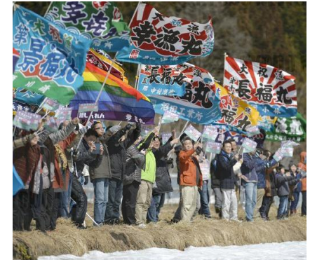
People celebrating the opening of the Hokkaido Shinkansen with big fishing flags, 2016