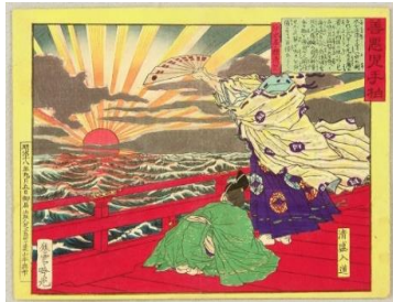
Priest Kiyomori, an old Kabuki story , by Ginko Adachi, 1885