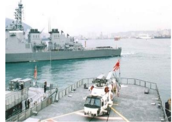
Naval event in Busan 1998

(a Ground Self-Defense Force unit with a Singaporean unit)