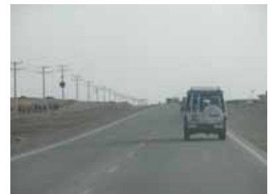
Primary road from Kabul to Kandahar