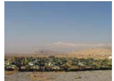
Heavy armaments collected in DDR

Support for refugees and IDP, food aid, etc.