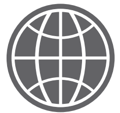
The World Bank