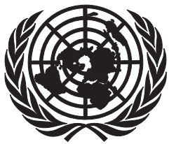
Office of the Special Adviser on Africa