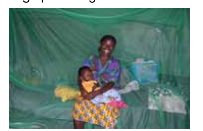
LLITN user in Sierra Leone