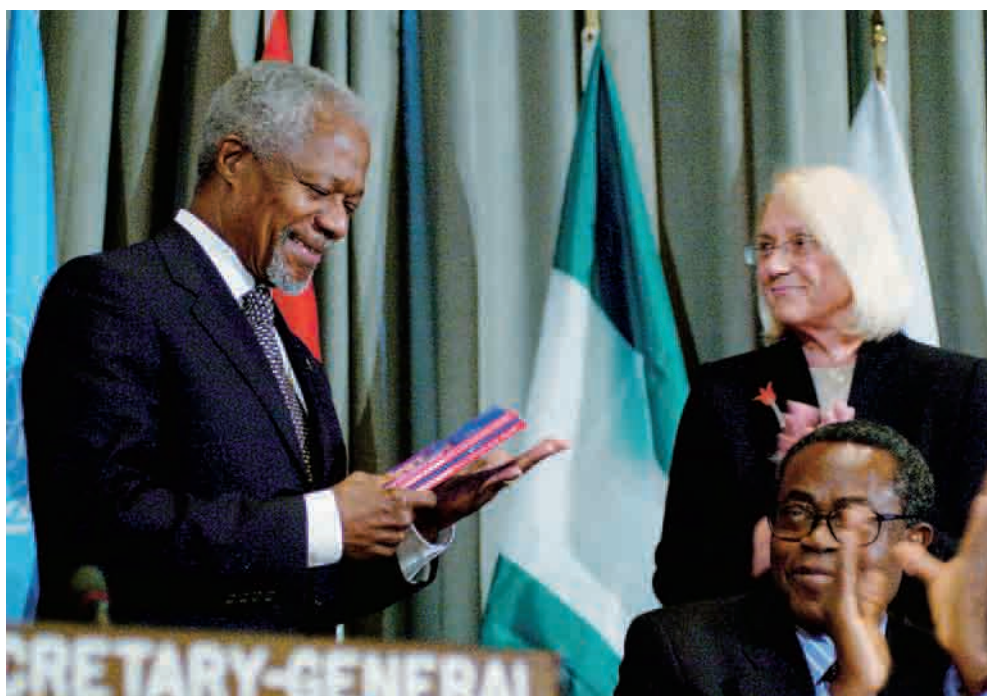
The UN Secretary-General receiving the Challenges of Peace Operations Project Concluding Report 2006 from the Swedish Minister for Foreign Affairs at a one-day formal presentation and seminar meeting at the UN Headquarters in New York on 19 January 2006. Building on the achievements of the Challenges of Peace Operations: Into the 21st Century Project (1997-2006) and its unique network of Partner Organizations, the Challenges Partners decided at the meeting in New York to establish the International Forum for the Challenges of Peace Operations.

or contact the Project Leader listed in the back of the catalogue.