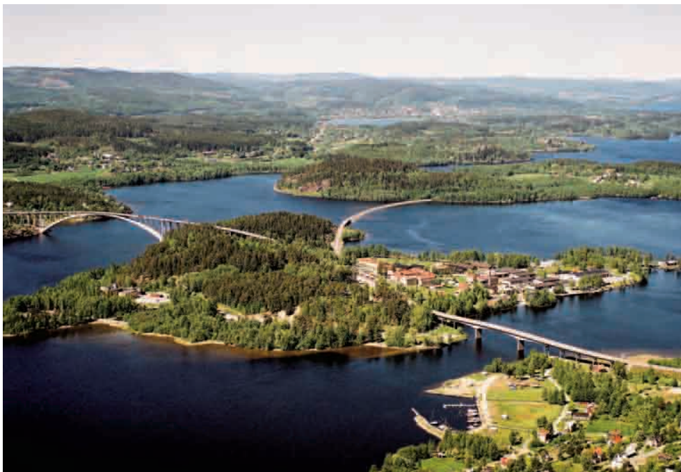
The campus of the Folke Bernadotte Academy on the island of Sandö.