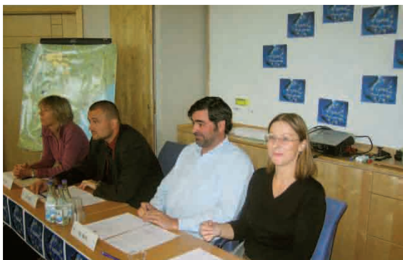
Participants of the 2006 CMCO-course giving a press conference during a role play.