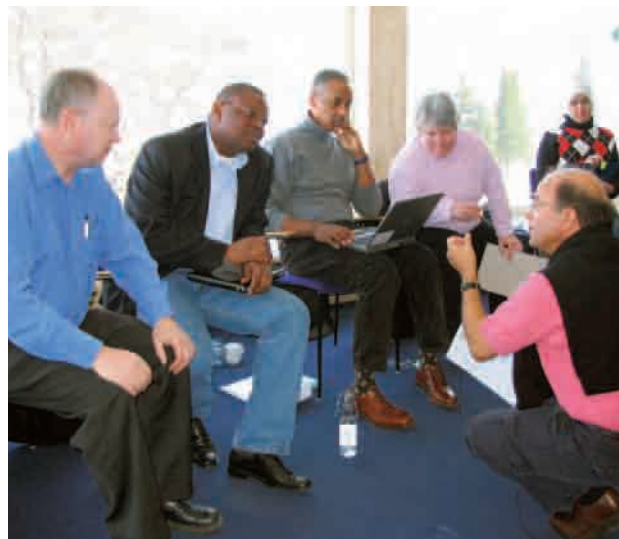
Dialogue and experience sharing at the 2006 course.

This composition will enable the participants to get an overview of the whole process and provide a space where inter-personal and institutional networks can