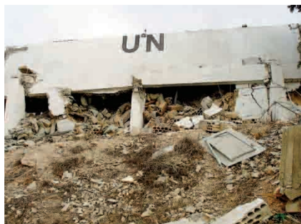
Two photos of the destroyed United Nations Interim Force in Lebanon (UNIFIL) patrol base in El-Khiam, southern Lebanon. On 25 July 2006, the base was destroyed by an Israeli aerial strike, killing four unarmed UN military observers. The base came under recurrent incidents of close firing and UNIFIL reported that, in total, 21 strikes were made within 300 meters of the patrol base.