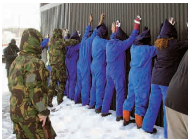
The course participants are faced with several realistic situations during the training, all of which are based on authentic mission situations.