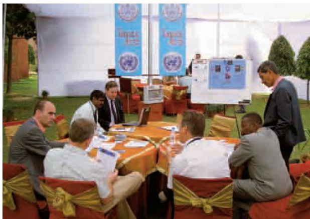
The IAPTC conferences provide a true multinational and multi-disciplinary platform for addressing the education and training challenges of complex peace operations. This picture was taken during the 2005 IAPTC conference in India.