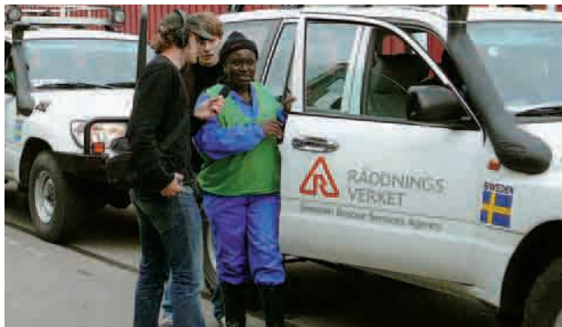
Media training is an important part of this scenario-based course.