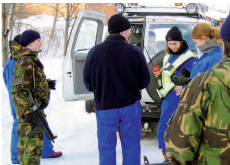
Many of the courses arranged by the Academy include risk assessments and safety training, designed to resemble situations that can occur in future missions.