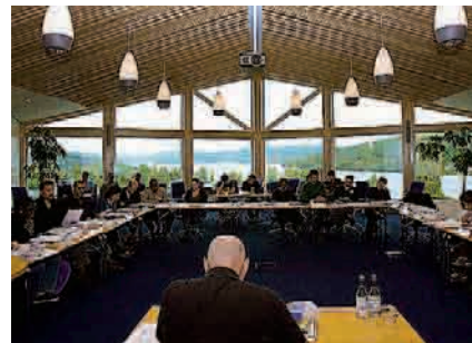
During 2006, the Academy's new premises on Sandö were completed and a new feature is the Count Bernadotte Room.