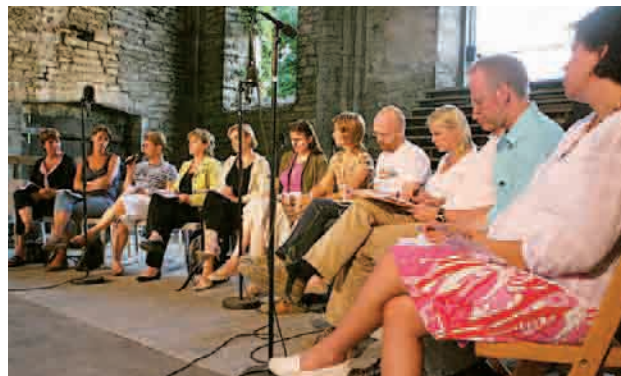
The Folke Bernadotte Academy hosted a discussion between representatives of five Swedish peace organizations and members of parliament from all political parties with a special interest in peace and security related issues. The event took place in Visby, in July 2006.

The purpose of the fund is to increase an understanding of complex peace related issues among the Swedish public and to discuss Swedish foreign policy. In addition, the Academy facilitates meetings and discussions between the Swedish NGO community and government officials. The fund amounts to approximately €1,6 million. Support can be applied for two times a year.