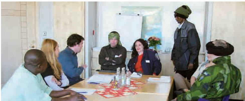
Course participants during a role play in the 2006 version of the course.