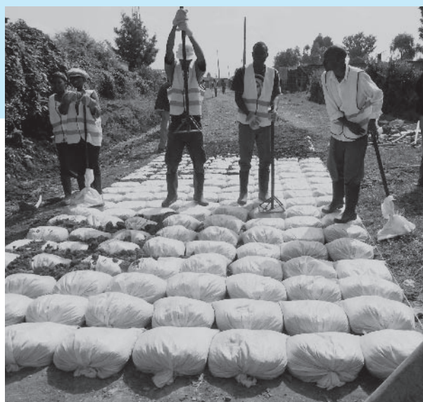
Roads are being revitalized thanks to work by locals trained in Do-nou technology

Meanwhile, Japan too is in the process of advancing employment regulation reform in order to further energize its own young people and turn employment into a driving force for growth. As such, in the midst of growing global interest in employment, Japan has much to contribute to the world. The utilization of Japan’s experiences up to this point and the enhancement of collaborations with the many actors working on resolving employment issues – including international organizations, non-governmental organizations (NGOs), and non-profit organizations (NPOs) – are expected to strengthen the