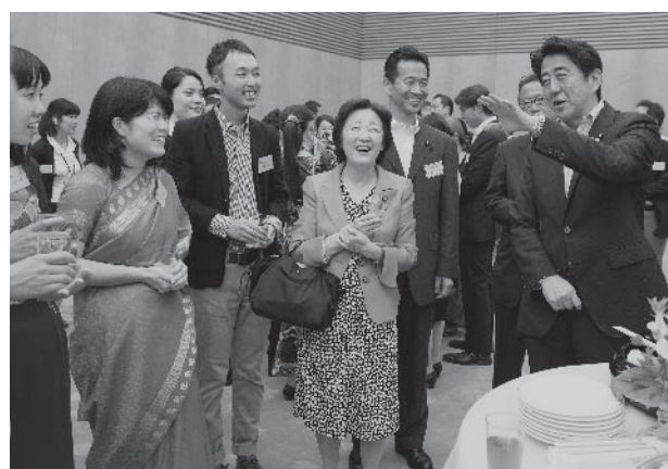
Prime Minister Shinzo Abe talking with Japan Overseas Cooperation Volunteers at the reception to offer words of encouragement to them.

The JOCV and SV programs, which forge consistent links between people, create grass-roots connections