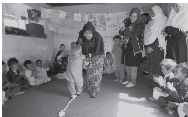
Children playing a balancing game as a part of pre-school education in Bamiyan Province, Afghanistan.

variety of collaborative measures related to development cooperation activities of NGOs, including financial assistance, capacity building, and increasing dialogues between NGOs and MOFA.