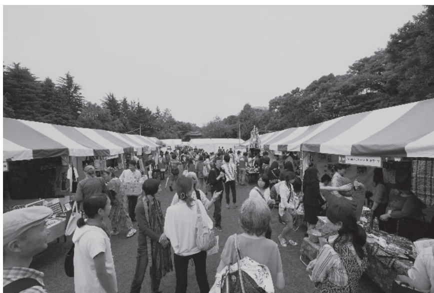
A lot of organizations engaged in international cooperation participated in Global Festa JAPAN 2013.

Global Festa JAPAN is held annually around the time of the International Cooperation Day (6th of October)* as one of Japan’s largest international cooperation events. The event is