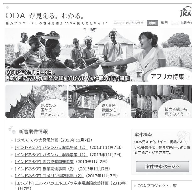
ODA visualization site, the “ODA mieru-ka site” http://www.jica.go.jp/oda

The “ODA mieru-ka site” (website for visualization of ODA) was launched on the JICA website in April 2011 to enhance transparency to increase public understanding and support for ODA. Photographs, ex-ante/ex-post evaluations, and other information are being posted as needed to enrich information, in order to communicate to the people about the ODA projects around the world, in an easy-to-understand manner, such as an overview of each loan aid, grant aid that JICA is implementing, and technical cooperation projects, as well as the process from project formation to completion. Likewise, lists summarizing the specific achievement status of projects and lessons learned from projects implemented in the past, including those where an effect was achieved or where a sufficient effect was not produced, have already been publicized three times to promote more effective implementation of ODA.