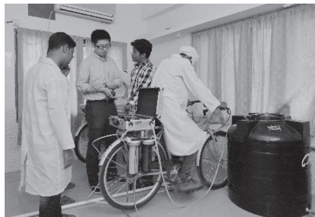
BOP business using water purification units combined with a bicycle which has been deployed in Bangladesh.

a push to the overseas expansion of private business as well.