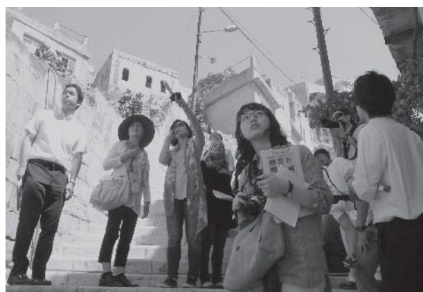
Participants visiting Jordan as international cooperation reporters.

Providing as many people as possible with opportunities to experience development cooperation by visiting at actual sites where ODA projects are implemented is one of the most effective ways to deepen their understanding of ODA. Japan also promotes support for on-site ODA observation through study tours (e.g. university seminars), or by teachers and representatives from local governments. In addition, partnerships with travel agencies to conduct the experience tours and observation tours are being strengthened. A new program, “International Cooperation Reporters” (implemented by JICA), began in 2011, in which the public observes actual ODA project sites and reports at various events after returning home. Reporters were sent to Kenya and Viet Nam in August 2011, to Uganda and Sri Lanka in August 2012, and to Rwanda and Jordan in August 2013