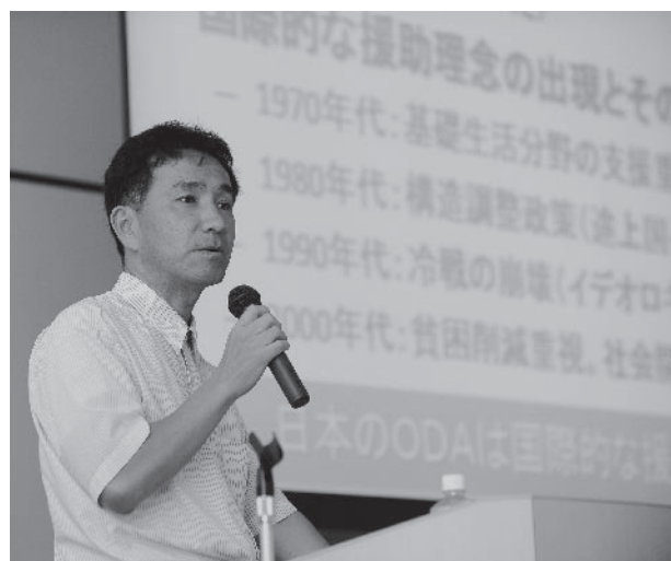
A staff of the Ministry of Foreign Affairs explaining Japan's ODA at an ODA Delivery Lecture

MOFA sends staff to junior-high and high-schools, universities, local governments and NGOs to give “ODA Delivery Lectures” which explain and comment on international cooperation and ODA. In addition, in order to promote development education, JICA holds the “Global Education Contest” 2 (JICA has been the main sponsor since FY 2011) to solicit teaching materials for development education. Similarly to assist development education, in response to requests from school education on the ground and local governments that promote internationalization, JICA sends experienced JOCV to schools as lecturers, and they implement “International Cooperation Delivery Lectures” that communicate life in developing countries and stories of personal experiences and aim to promote understanding of different cultures and international understanding, as well as the “International Cooperation Experience Program” that focuses on high-school and university students, and the “JICA International Cooperation Junior-High and High-School Student Essay Contest” for junior-high and high-school students. Furthermore, “Development Education