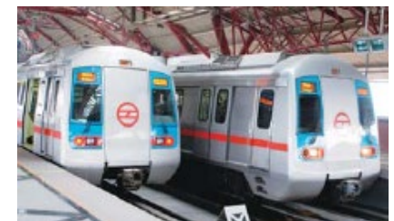
Mass rapid transport system project in India

JICA supports developing countries by lending low-interest, long-term and concessional funds to finance their development efforts.