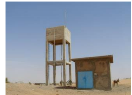
Regional water supply project in Mauritania

JICA grants development funds to developing countries to support the building of facilities and procurement of equipment and materials necessary for economic and social development.