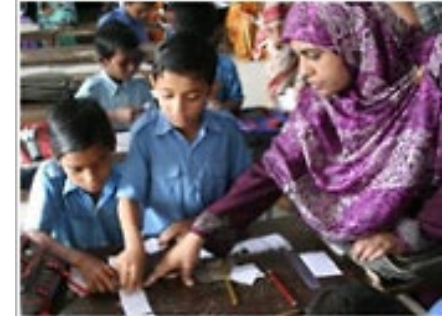
Science and math class at primary school in Bangladesh

JICA provides support to developing countries for the development of human resources, institutional development, dissemination of technology and R&D necessary for their economic and social development.