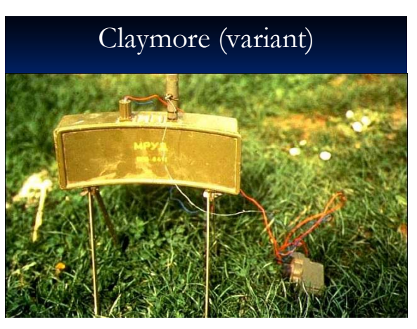
Another Type of Mine