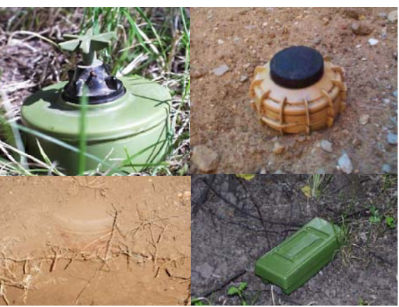
Types of Landmines