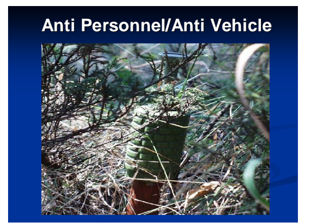
Locations of Landmines