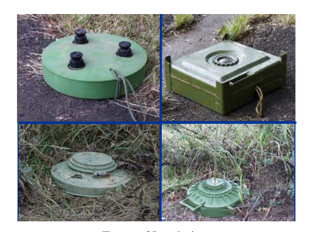
Types of Landmines