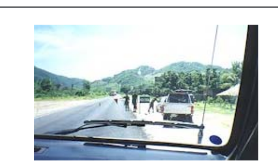
Checkpoint ahead. Your response ? Let's go see...