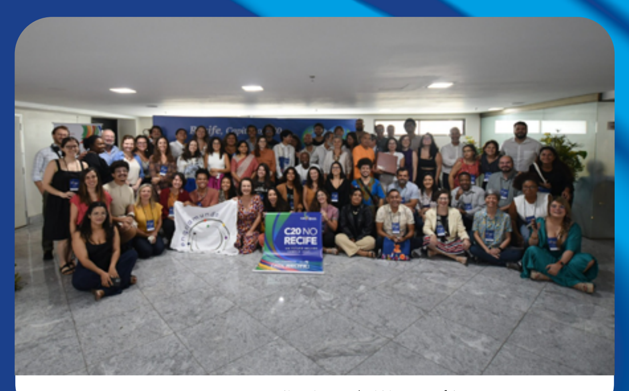
Inception Meeting (24 - 26 March, 2024 in Recife)