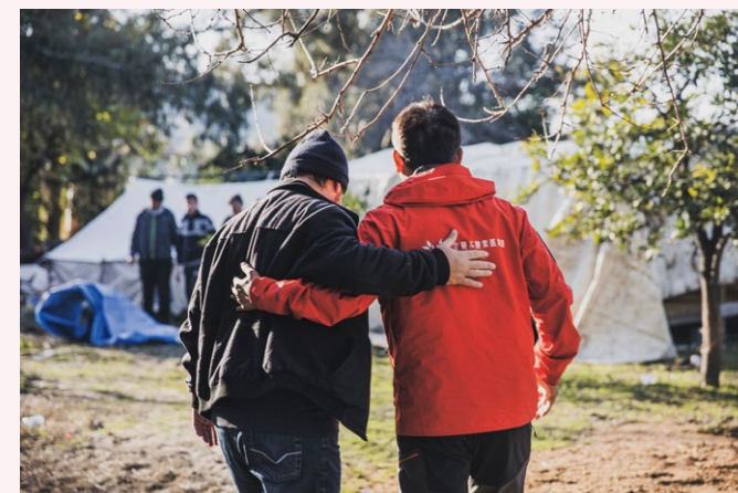
Türkiye "Let's walk the same path together"