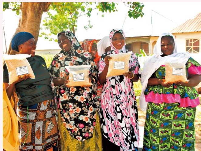
Nigeria "Delicious and nutritious!"