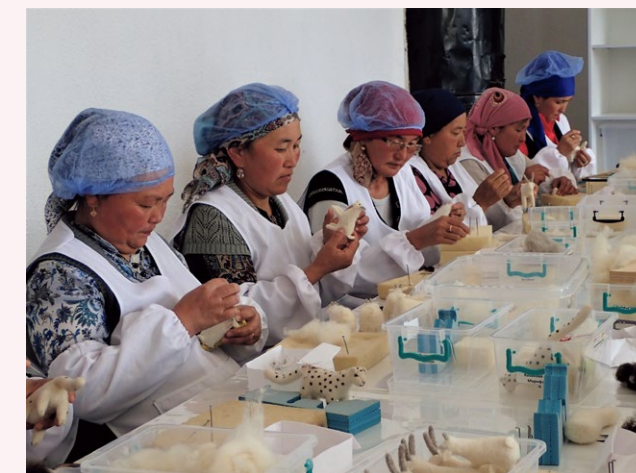
Kyrgyz Republic "A stitch of happiness"