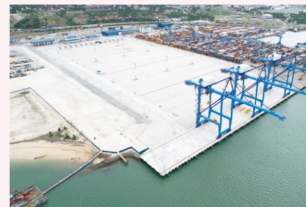
Kenya “Mombasa Port Development Project” (Yen Loan)

The interior view of a plant that desalinizes highly saline groundwater using Japanese environmental technology. This plant has made it possible to secure drinking water for local residents in Tunisia, where the amount of precipitation is decreasing.