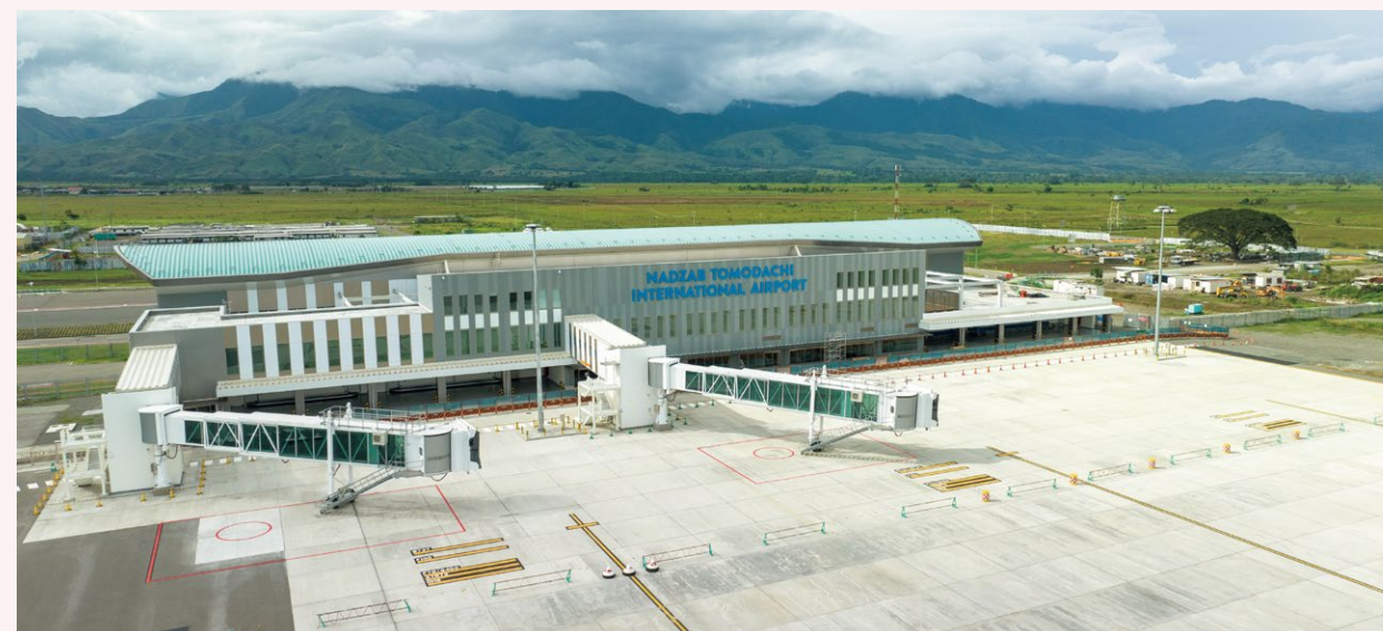
Papua New Guinea “Nadzab ‘Tomodachi’ Airport Redevelopment Project” (Yen Loan)

A panoramic view of Mombasa Port, the largest international trading port in East Africa. Japan supported the construction of a container terminal and other items, contributing to the promotion of trade throughout the region.