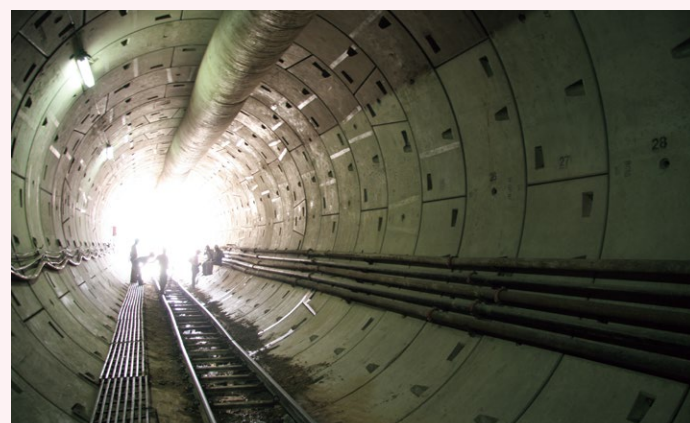
India “Delhi Mass Rapid Transport System Project” (Yen Loan)

Supporting the rehabilitation, construction, and expansion of village water supply facilities ensured safe and stable water supply, improved the sanitary conditions of the residents in the target areas, and reduced the water drawing labor for children and women.