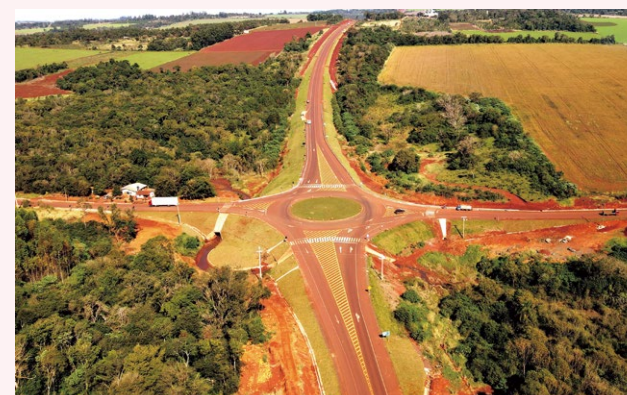
Paraguay “Eastern Region Export Corridor Improvement Project” (Yen Loan)

The construction and improvement of the passenger terminal building, runway, taxiways, and control tower have greatly enhanced essential air transportation in the island nation of Papua New Guinea. In the initiative of Prime Minister Marape of Papua New Guinea, the airport was renamed Nadzab Tomodachi International Airport as a symbol of the friendship between the two countries.