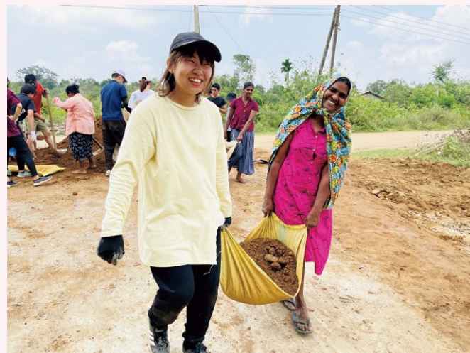
Sri Lanka "Working together" (good!)