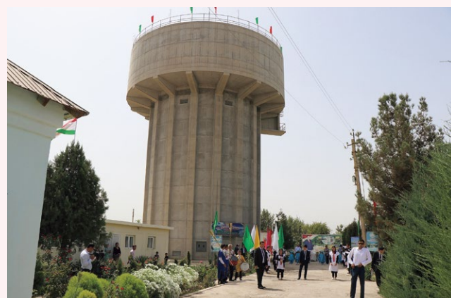
Tajikistan “Project for Rehabilitation of Drinking Water Supply Systems in Pyanj District, Khatlon Region” (Grant Aid)

Japan works to develop quality infrastructure that supports the lives and economic activities of people living in developing countries and serves as the foundation for their national development.