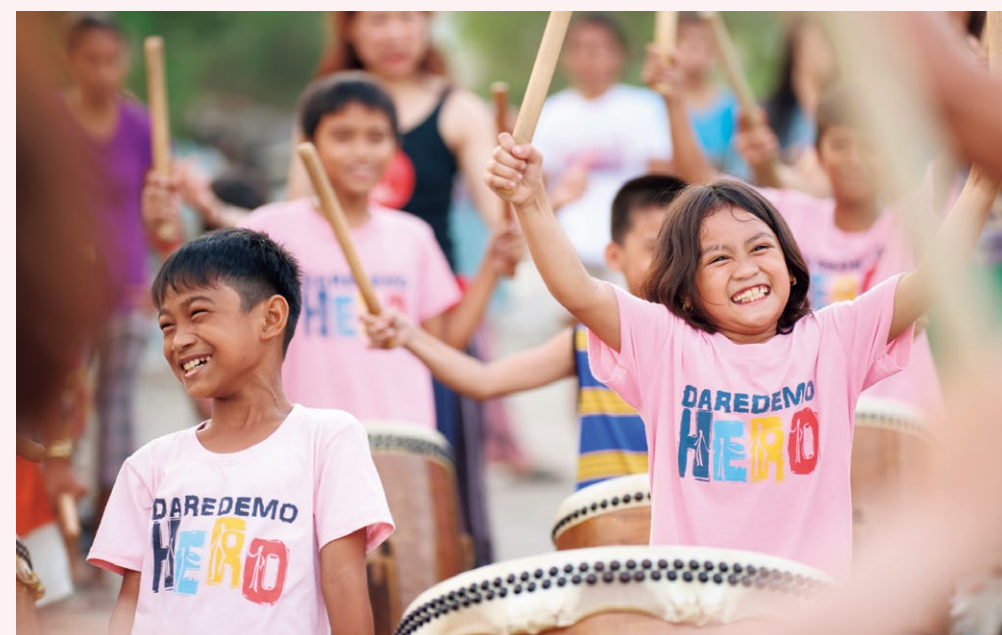
Philippines "Reach the sky! The sound of the drums crosses borders."

This collection of photographs is from the "Global Festa JAPAN 2023" photo contest. (See page 153 for details.)