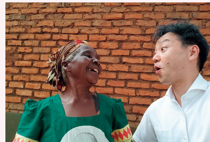
Malawi "Beyond words"