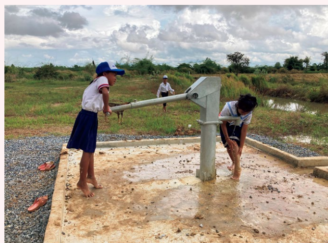
Cambodia "I'm doing this for you. You're doing it for me."