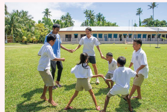
Palau "Fun physical education class on a southern island"