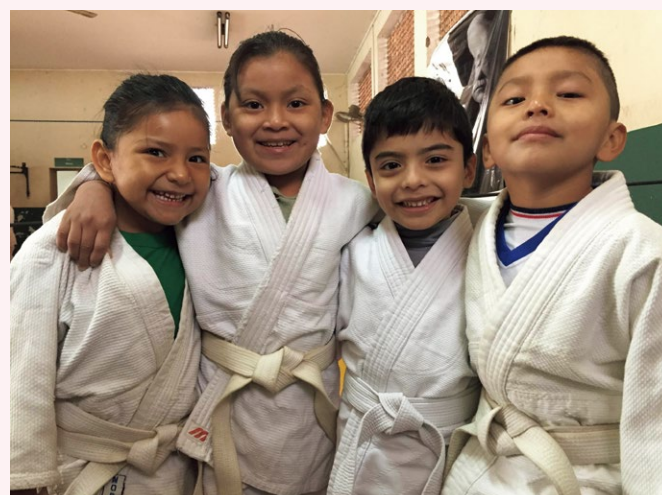
Bolivia "Future Judokas (Judo practitioners)"