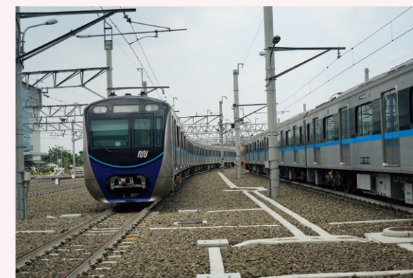
Indonesia “Construction of Jakarta Mass Rapid Transit Project” (Yen Loan)

The paving of connection roads to ports located along rivers and the replacement of bridges have improved the transport capacity of Paraguay, which relies on river and road transport.