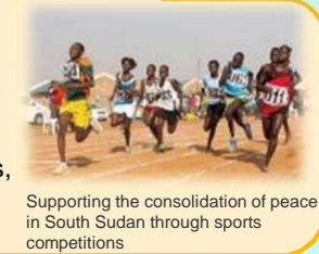
Supporting the consolidation of peace in South Sudan through sports competitions