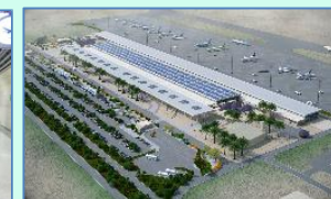
The Borg El Arab Int'l Airport (3D rendering)