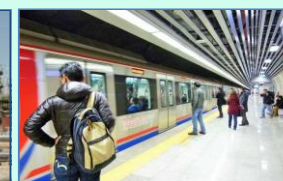
Bosphorus Rail Tube Crossing