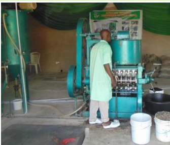
The Project for Construction of Shea Butter Processing Centre in Gwagwalada Area Council in the Federal Capital Territory (2013)