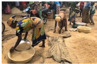
The Project for Quality Enhancement of Rice in Lafia Local Government Area in Nasarawa State (2014)