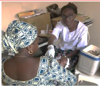
The Project for Improvement of Primary Health Care in Alimosho Local Government Area in Lagos State (2017)