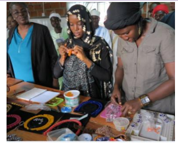
The Project for Construction of Durumi Vocational Training Centre in Bwari Area Council in the Federal Capital Territory (2015)