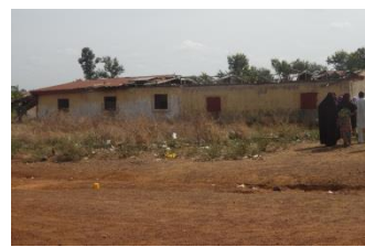
The Project for Construction of Shere Koko Primary Health Centre in Bwari Area Council in the Federal Capital Territory (2015)