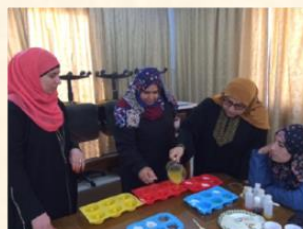
"Hand-made soap" training for women who cannot work outside