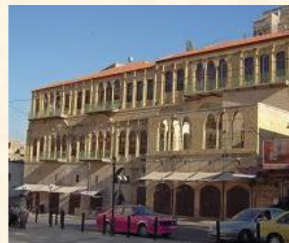
Salt Tourism Sector Development Project in 1999