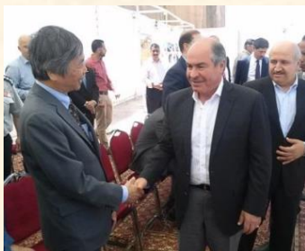
Sakurai Ambassador & Mulki Prime Minister