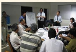
Project on Dissemination of Quality /Productivity Improvement (Kaizen) Practices for Small and Medium Enterprises (2010-2013)