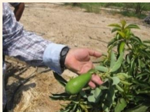
Tropical fruits production in cooperation with local farmers