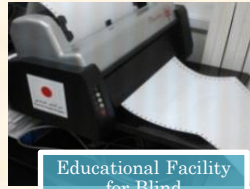
Educational Facility for Blind

-The Project for Improvement of Food Cold Storage Facility in Amman