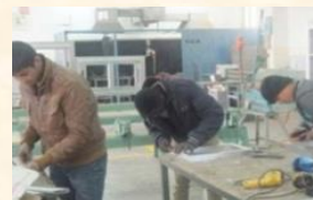
Project for Strengthening the Capacity of Training management of Vocational Training Corporation (2006-2010)