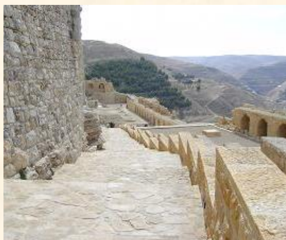
Karak Tourism Sector Development Project in 1999