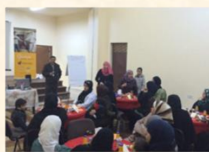
Workshop for the awareness raising of Women's work opportunity

In 2006, Japan proposes its concept of creating "THE CORRIDOR FOR PEACE AND PROSPERITY" in cooperation with Israelis, Jordanians and Palestinians. The concept is to work collaboratively to materialize projects that promote regional cooperation for the prosperity of the region, such as establishing an agro-industrial park in the West bank and facilitating the transportation of goods.