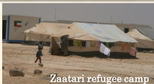
Zaatari refugee camp

Japan provides Emergency Grant Aid for the governments of affected countries or international and other organizations (including Red Cross and Red Crescent Societies), with a view to providing urgent support for refugees, internally displaced persons (IDPs), or people affected by natural disasters and/or conflicts.