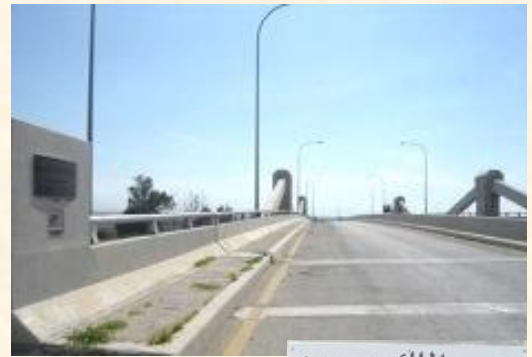
The Project for Construction of the King Hussein Bridge (FY 1999: 1,215 million yen)