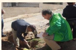
Project for formulating Water Supply Plan for the Host Communities of Syrian Refugees (2013-2016)