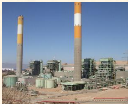
Aqaba Thermal Plant in 1994/1996

*Japanese Fiscal Year (FY) runs from April 1 st to March 31 st