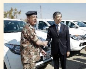
UNOPS: Safety and Security to Respond to the Syrian Refugee Crisis