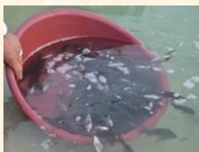
Tilapia farming experiment