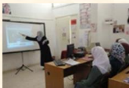
Capacity Development of Learning Resources Centers (LRCs) for Science Education utilizing ICT (2006-2009)