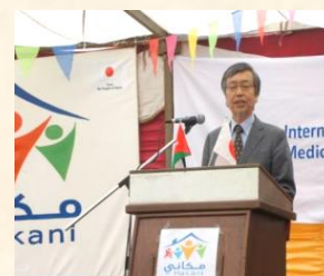
UNICEF: Opening Ceremony for Informal Education Center in refugee camp