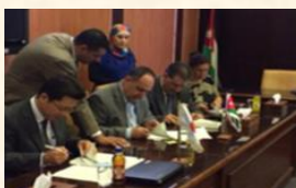
The Project for the Study on Electricity Sector Master Plan in The Hashemite Kingdom of Jordan (2014-2017)