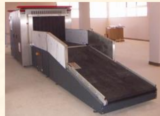
Project for Improvement of Airport Security Equipment at Queen Alia International Airport in Jordan (FY 2009: 1,473 million yen)

Project for Introduction of Clean Energy by Solar Electricity Generation System (FY2010: 640million yen)