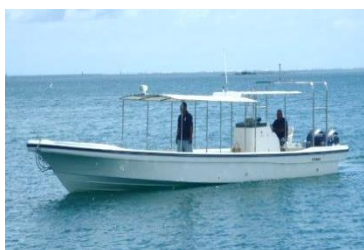
Rescue Boat procured for Kosrae State (August 2017)