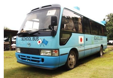
The Project for Procuring a School Bus for St. Cecilia School Students in Chuuk State (September 2018)