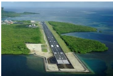
Project for Improvement of Pohnpei International Airport (expansion of runway) (June 2012)

Financial assistance aiming for improving basic infrastructure such as roads, airports and ports. 40 projects (budget base) have been implemented since its inception in 1980.