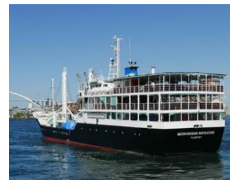
Project for Improvement of Domestic Shipping Services (Micronesian Navigators) (April 2015)