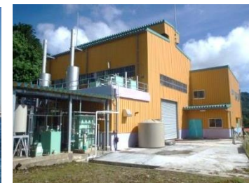
Project for Power Sector Improvement for the State of Kosrae (early 2019)