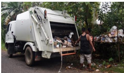
Garbage Collecting Truck procured for Nett Municipality in Pohnpei State (April 2017)