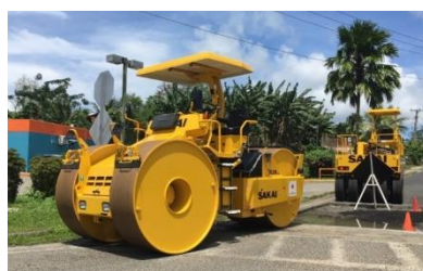
Static Macadam Roller procured for Pohnpei State (April 2018)