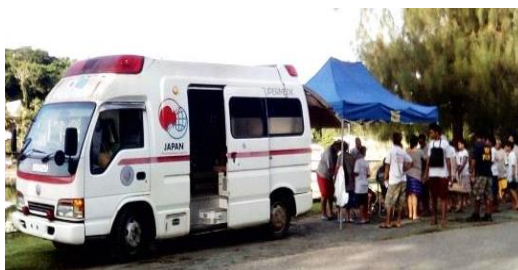
The Project for Health Care Service Improvement, Yap State (procurement of a clinic car) (May 2013)

Financial assistance for NGOs or local public organizations by providing funds up to 10 million Japanese yen per project. As of November 30 th 2018, 100 projects have been implemented since its inception in 1995.