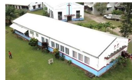
The Project for Reconstruction of School Library at Xavier High School in Chuuk State (September 2018)