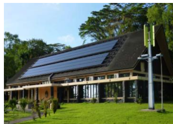
Project for the Introduction of Clean Energy by Solar Electricity Generation System (Palikir) (January 2013)