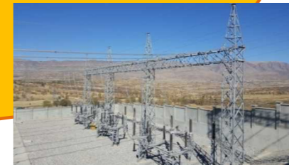
Substation for Deralok Hydropower Plant