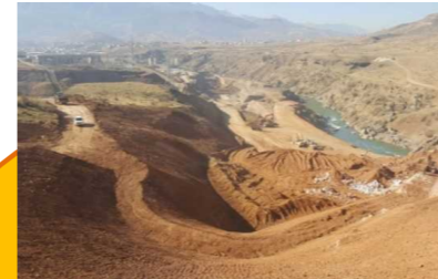
Deralok Hydropower Plant in Duhok (under construction)