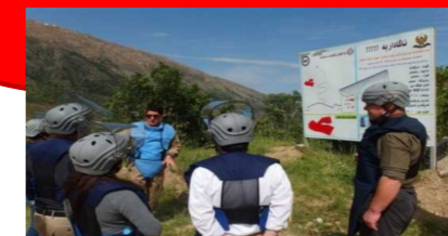
Site visit by JICA-CMAC (Cambodian Mine Action Centre) to mine field in Erbil Governorate