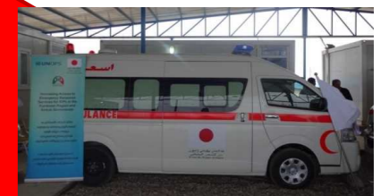
Ambulance for IDPs