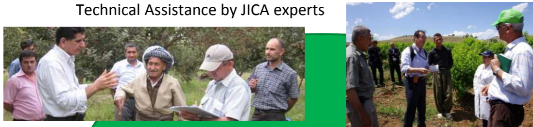
Technical Assistance by JICA experts