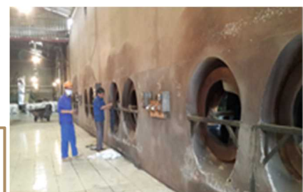
New tea drying machine at one of the models

→ Capacity development is most effective if conducted through actual works not just theory training.