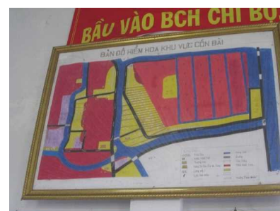
Hazard map posted inside one evaluation shelter

→ Practical training and involvement of non-targeted areas from the stage of project implementation are useful for project results dissemination.