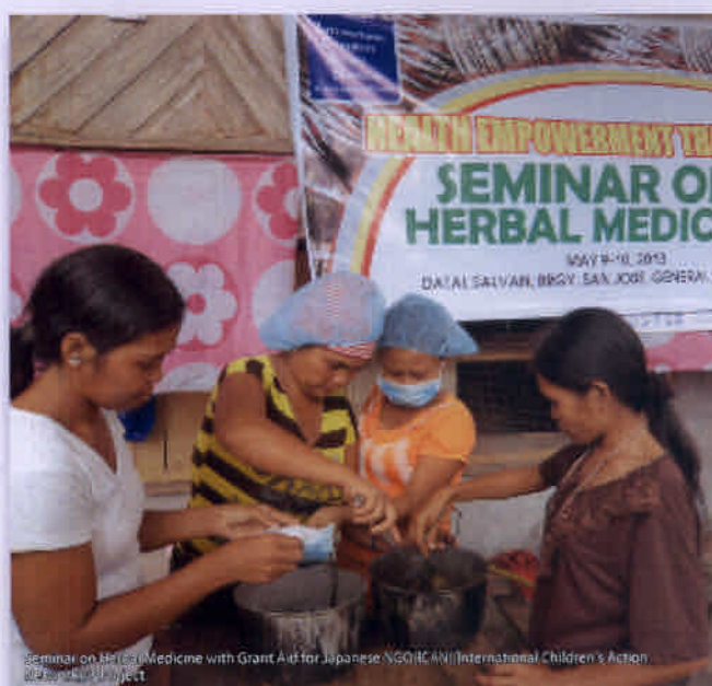
Seminar on Herbal Medicine with Grant Aid for Japanese NGO/ICANN/International Children's Action