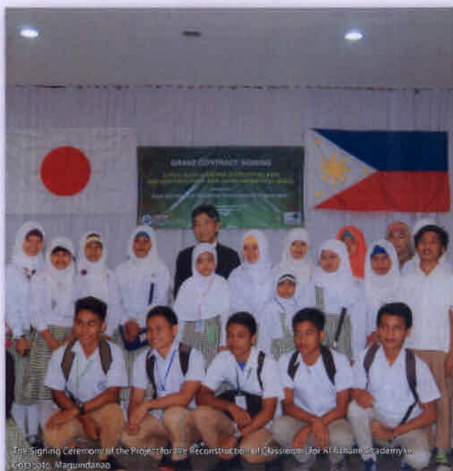
The Signing Ceremony of the Project for the Reconstruction of Classrooms for Al-Falah Academy in Cotabato, Maguindanao