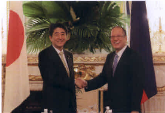
The summit meeting between Prime Minister Arai and President Aquino upon State Visit to Japan in June 2015.

During the State Visit of President Aquino to Japan, the Government of Japan announced J-BIRD2, the new phase of J-BIRD in the Joint Declaration of the summit meeting in June 2015. J-BIRD will focus more on economic autonomy in Bangsamoro Area in this phase.