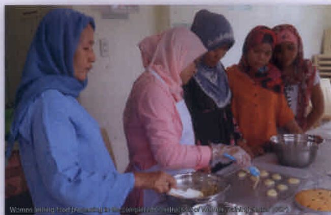
Women in Mindanao preparing food for the completion of the project for Women's Welfare Center