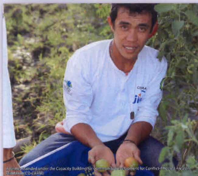
A farmer trained under the Capacity Building for Community Development for Conflict-Affected Areas in Mindanao (CD-CAAM)