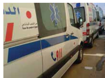
Providing cars in Azraq Camp.