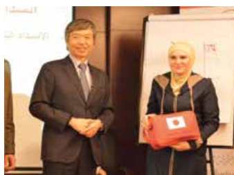
First Aid Training Kit. Photo by IFRC