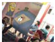
Providing Hygiene Education in schools in Jordan