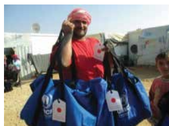
Winter Clothes Distribution.