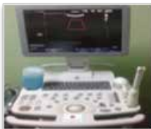
Upgrading the Ultrasound Equipment