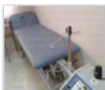
Supporting the Children with Disabilities