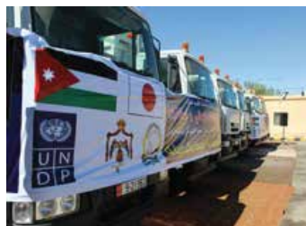
Providing Social Service Equipment.

19.183 million $ UNICEF, WFP, UNHC, IFRC, IOM, UNIDO, UNOPS