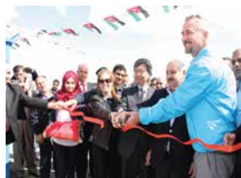
Waste Water Treatment in Zaatari camp.