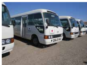
Providing cars in Azraq Camp.