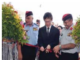
Civil Defense Center in Zaatari Camp.