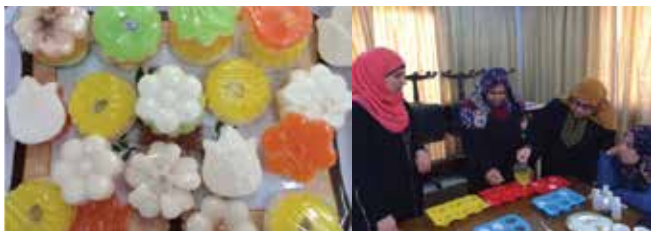
"Hand-made soap" training for women who cannot work outside

IN 2006, Japan proposed its concept of creating "the corridor for peace and prosperity:" in cooperation with Israelis, Palestinians and Jordanians. The concept is to work collaboratively to materialize projects that promote regional cooperation for the prosperity of the region. JICA (Japan International Cooperation Agency) has implemented numbers of projects for empowering and enrichment of refugees, and various kinds of supports in Jordan.