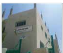
Second Floor renovation