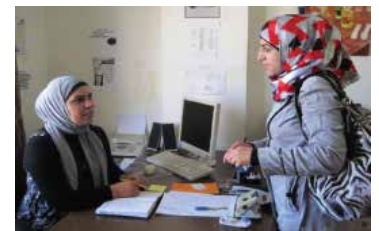
Career Counselling for Women