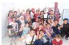
Psychosocial Care Workshop for children in Zarqa