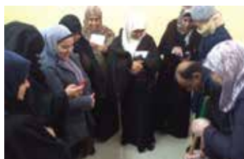
Training for Olive Oil Soap