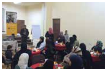
Workshop for the awareness raising of Women's work opportunity