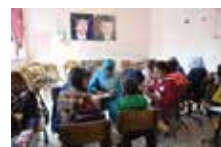
Remedial class in Public schools in Amman