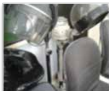
Supporting Income Generating for Women's Society