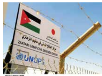
Civil Defense Center in Zaatari Camp.