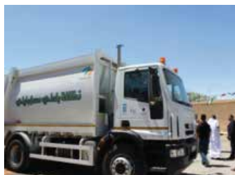
Improved delivery of municipal and social service.