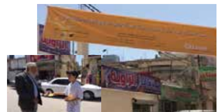
Awareness raising for Women' working outside of houses