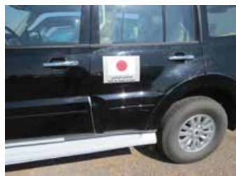
Providing cars in Azraq Camp.

27.698 million $ UNICEF, WFP, UNHCR, IFRC, IOM, UNOPS, UNODC, UN Women