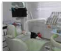
Improvement of Medical Equipment