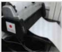
Improvement of Educational Facility for the Blind

The Government of Japan has implemented the grant assistant to non-profit organizations that implement development projects at grass-roots level including international/ local NGOs, local public authorities, educational institutions, hospitals and medical institutions. This project targets to improve Basic Human Needs in Jordan. Since 1990 , The Government of Japan has supported 163 projects in many fields such as renovations of schools, providing medical equipment or items for productive kitchen, and so on.