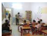
Implementing remedial class for both Syrian refugees and Jordanian students