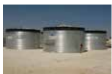
Providing Water Supply System in Zaatari Refugee Camp