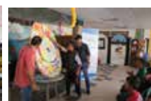
Non-formal Education in Zaatari Refugee Camp