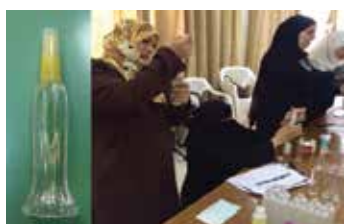
Training for perfume making