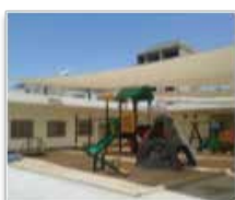
Improving the KG playground