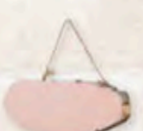
মস্ক পংক (৩০ml, ১৭০ml)