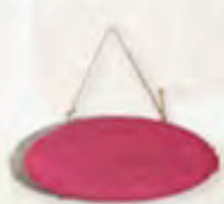
ওয়াইন রড (১৭০ml)