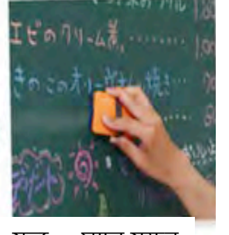
সহে মাছা সম্ভব