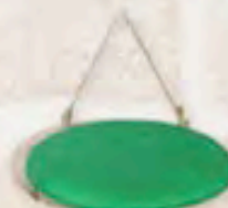
হালকা সবুজ (১৭০ml)