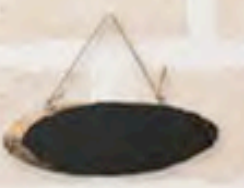
কাল (৩০ml, ১৭০ml, ৬০০ml)

প্রত্যেক রঙের নে ব্র্যাকেটের মে বক্রিত সাইজের লাইনআপ