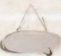
ধূসর (৩০ml, ১৭০ml)