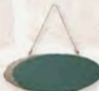
সবুজ (১৭০ml, ৬০০ml)