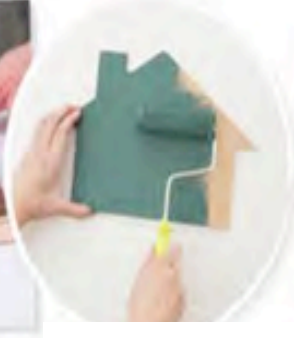
বড় পূে রালার ব্যবহার করে সহজ!