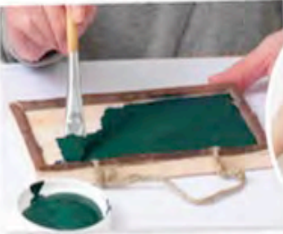
চকবোে রঙ মাথাে