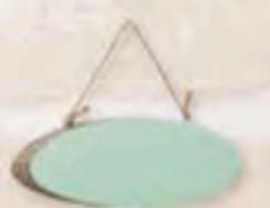
মন্ট (৩০ml, ১৭০ml)