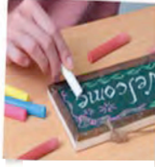
চক দে অংকন