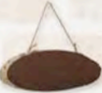
খয়েরী (৩০ml, ১৭০ml)