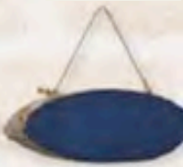
গাঢ় নীল (৩০ml, ১৭০ml)