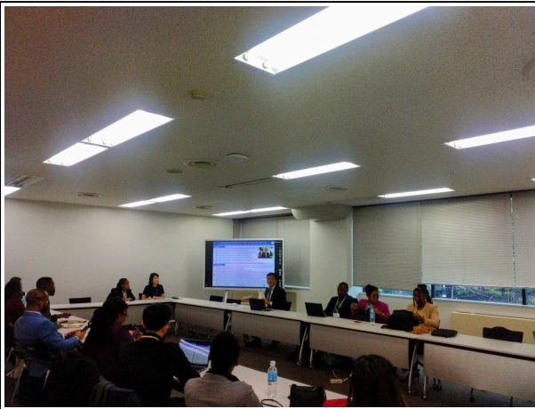
October 30 【Lecture】 MOFA