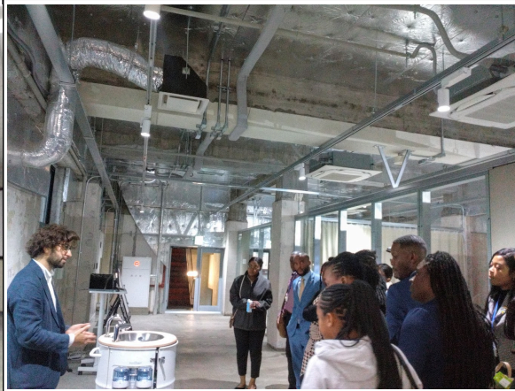
October 29 【Lecture/Observation】 WOTA Co.