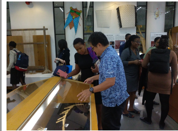
October 25 【Observation】 The University of the Ryukyus Museum(Fujukan)