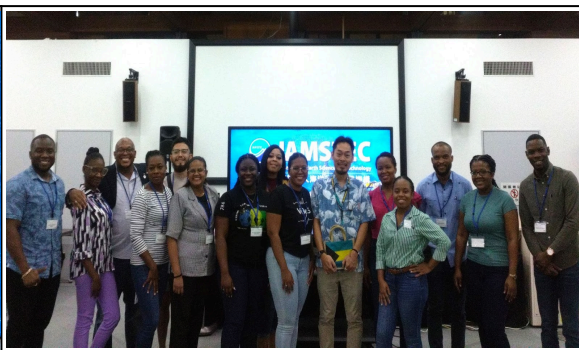
October 26 【Lecture/Observation】 Global Oceanographic DATA Center (GODAC)