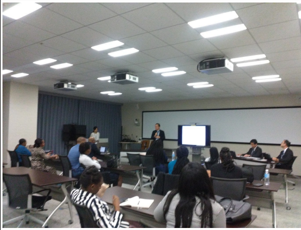
October 29 【Lecture】 JICA