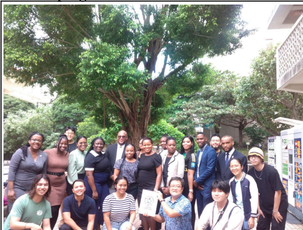
October 25 【Lecture/Exchange】 The University of the Ryukyus