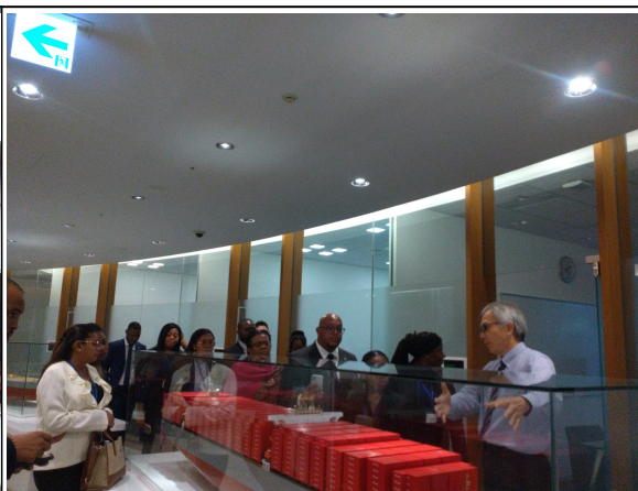
October 28 【Observation】 Kawasaki Kisen Kaisha, Ltd.