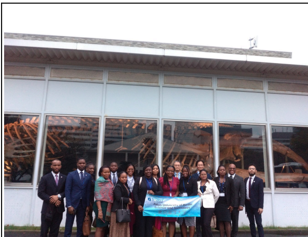
October 28 【Observation】 Tokyo University of Marine Science and Technology