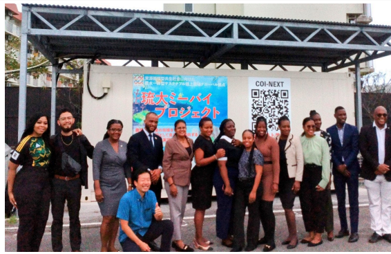
October 25 【Observation】 The University of the Ryukyus