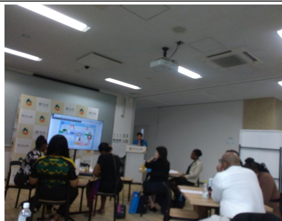
October 25 【Lecture】 The University of the Ryukyus