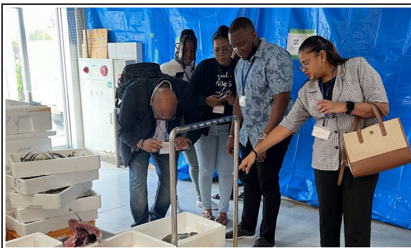
October 26 【Observation】 Fish Market