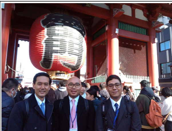
Jan 31 【Observation】 Asakusa