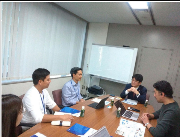
Jan 29 【Lecture】 Hagiwara Industries Inc.