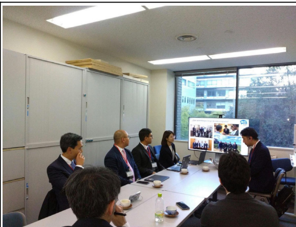
Jan 31 【Wrap up session】