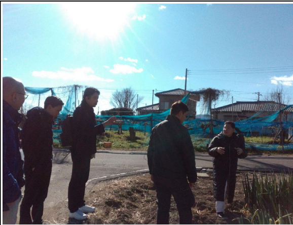
Jan 30 【Observation and Lecture】 TS Farm