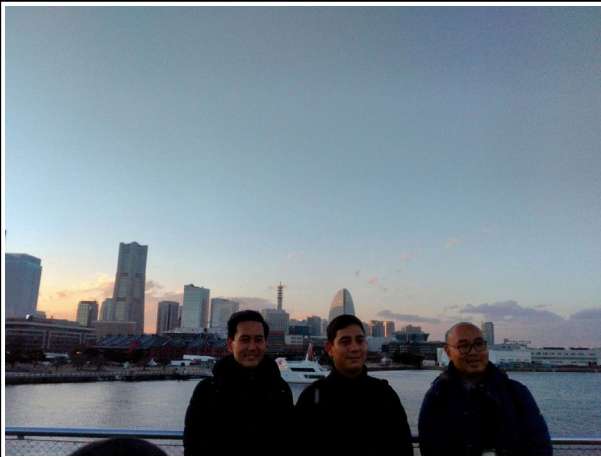
Jan 28 【Observation】 Osanbashi, International Passenger Terminal