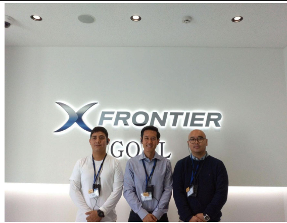
Jan 29 【 Observation】 Sagawa X Frontier