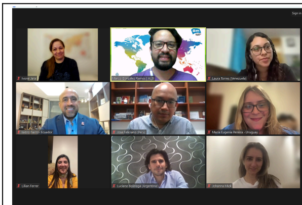
September 24 【Pre-departure orientation】