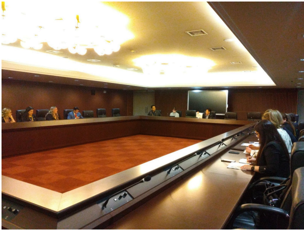
September 30 【Theme related lecture】 Ministry of Foreign Affairs, Japan