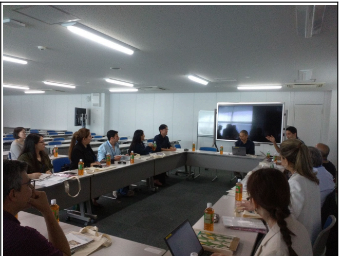
October 2 【Theme related lecture and observation】 Seika University