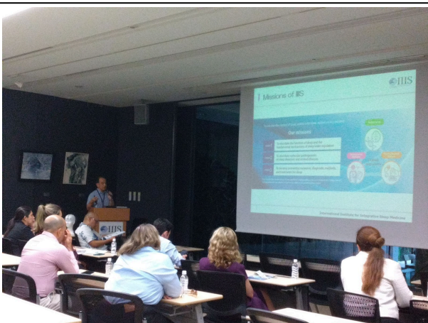
October 1 【Theme related lecture and observation】 International Institute for Integrative Sleep Medicine