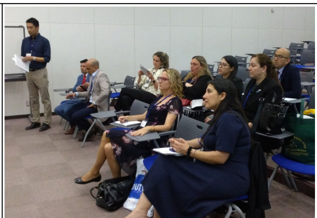
September 29 【Arrival orientation】