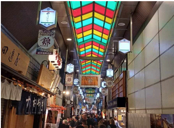
October 3 【Observation】 Nishiki Market