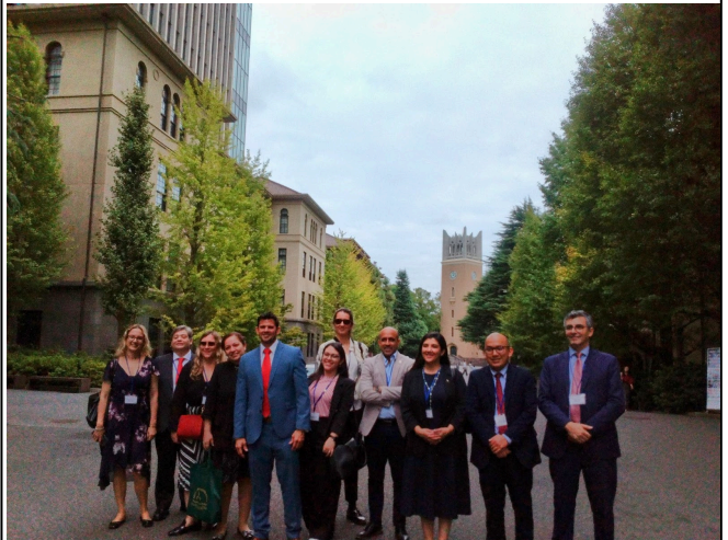
September 30 【Theme related lecture and observation】 Waseda University