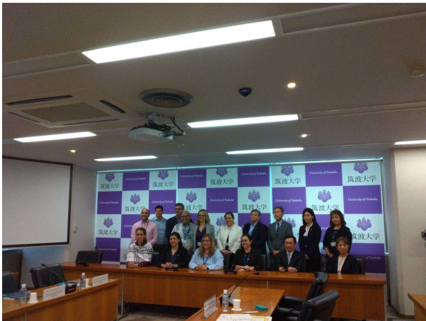
October 1 【Theme related lecture and observation】 Tsukuba University_Coutesy Call