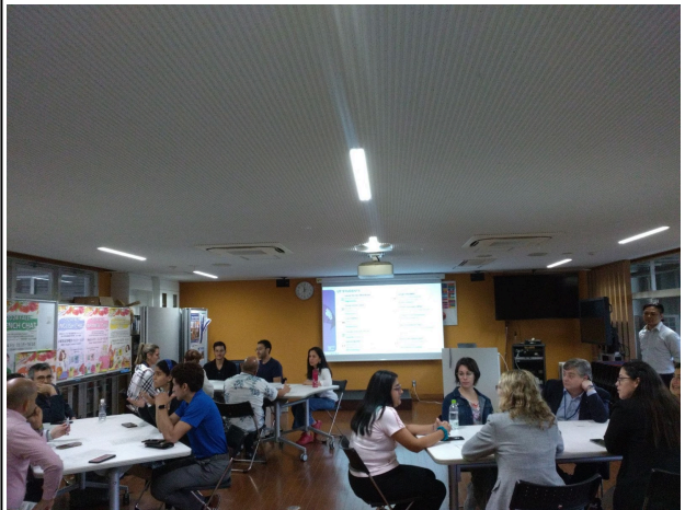
October 1 【Theme related lecture and observation】 Tsukuba University_Discussion with students from South America region