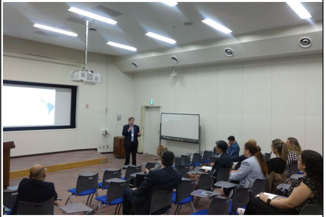
October 4 【Reporting session】