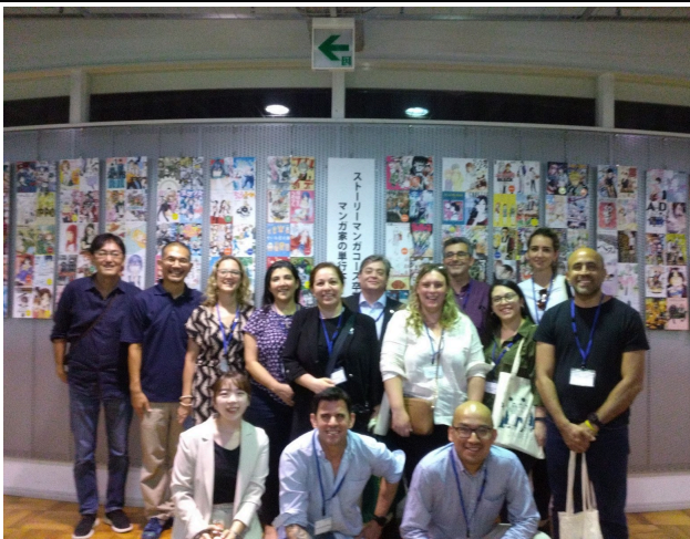
October 2 【Theme related lecture and observation】 Seika University