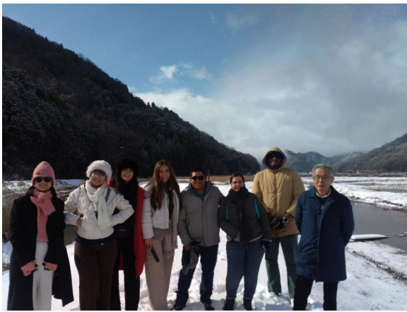
Feb 20 【Observation】 Hachigoro's Toshima Wetland