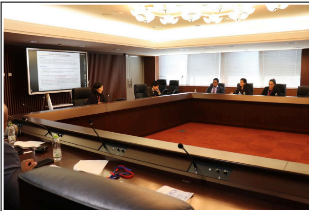
Feb 17 【Theme related lecture】 JICA