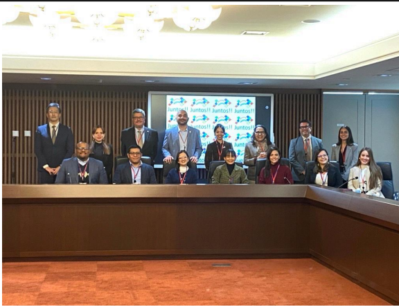
Feb 21 【Wrap up session】