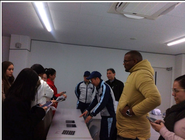
Feb 20 【Observation】 Kaneka Corporation