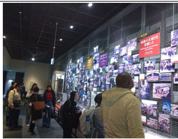
Feb 18 【Observation】 Disaster Reduction and Human Renovation Institute