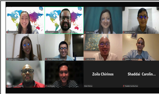
Jan 21 【Pre-departure orientation】