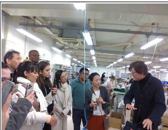
Feb 19 【Observation】 Yuri cooperation