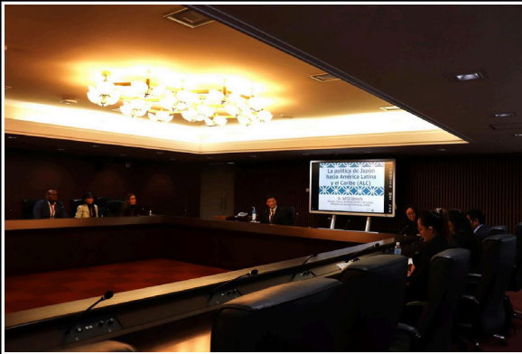
Feb 17 【Lecture】 MOFA