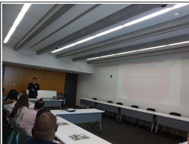
Feb 19 【Lecture】 Toyooka city