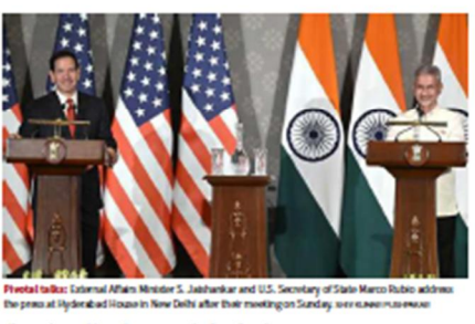
Pivotal talks: External Affairs Minister S. Jaishankar and U.S. Secretary of State Marco Rubio address the press at Hyderabad House in New Delhi after their meeting on Sunday. (see cover story on page 14)