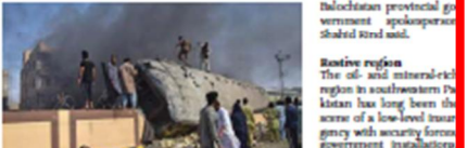
Scene of blast: Security personnel and locals attempt to organise the rescue efforts at the blast site in Quetta, Pakistan, on Sunday. (see cover story)

Associated Press QUETTA The attack, in an area usually having security forces present, badly damaged several nearby buildings and smashed more than a dozen vehicles parked along the road, according to eyewitnesses. Doctors at local hospitals said more than 20 people were under treatment in critical condition. Pakistan's President Asif Ali Zardari, who denounced the bombing, said militants and their backers sought to undermine Pakistan's role in regional and international peace efforts. Strongly condemning the attack, Pakistan's Prime Minister Shehbaz Sharif, in a post on X, called it a "cowardly act of terrorism" and offered