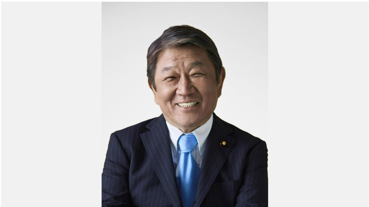
Japanese Foreign Minister Toshimitsu Motegi.

The Quad remains a "vital framework", Japanese Foreign Minister Toshimitsu Motegi said, responding to concerns that the four-nation grouping had lost its relevance, and indicated in an interview that 'Cooperation over Critical Minerals' needed for green energy and hi-tech would be at the top of the agenda for the Quadrilateral Foreign Ministers' Meeting (FMM) on Tuesday (May 25, 2026). Japan is working on critical minerals' projects in India, Mr. Motegi also said, but called for improved infrastructure, more tax subsidies, and protection for intellectual property rights.