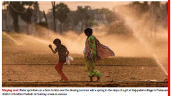
Staying cool: Water sprinklers on a farm to take over the blazing summer add a spring to the steps of a girl at Rappalavem village in Prakasam district of Andhra Pradesh on Sunday. (see cover story)