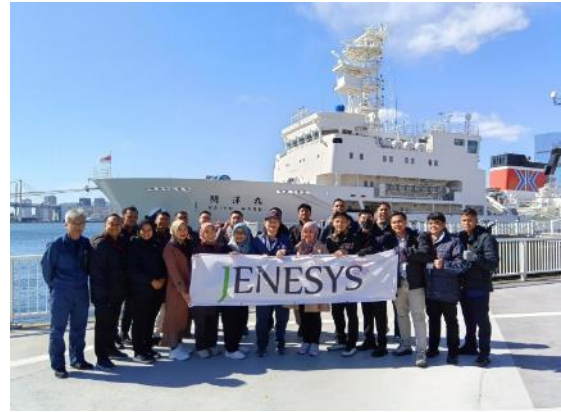
February 19, 2025 【Theme Related Observation】 Fisheries Agency's Fisheries Research Vessel "Kaiyo Maru" (Maritime Professionals Group)