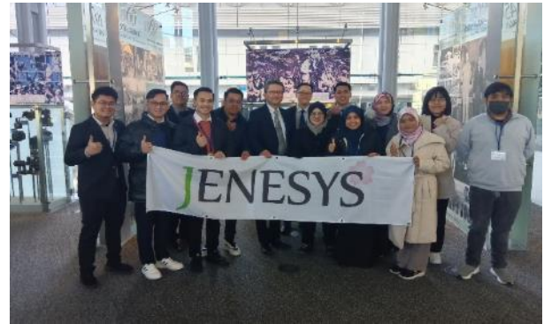
February 19, 2025 【Theme Related Observation】 "About KYODO NEWS" (Media and University Group)