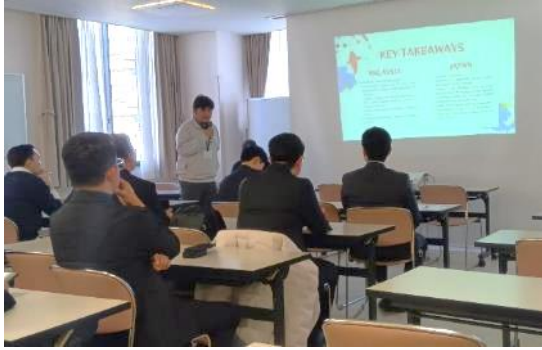
February 24, 2025 【Reporting Session】