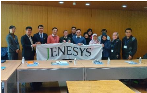
February 19, 2025 【Theme Related Observation, Exchange】 International Christian University (Media and University Group)