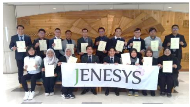
February 24, 2025 【Reporting Session】 Group photo