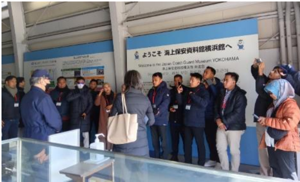
February 19, 2025 【Theme Related Observation】 Japan Coast Guard Museum YOKOHAMA (Maritime Professionals Group)