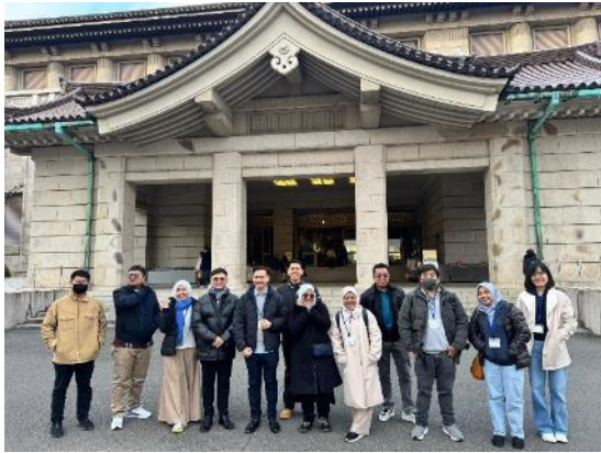
February 18, 2025 【Observation】 Tokyo National Museum (Media and University Group)