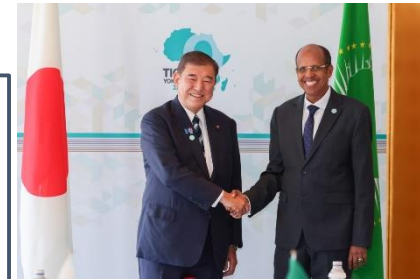
Japan-AUC Summit Meeting