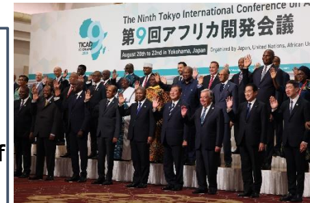
Group photograph of the participants