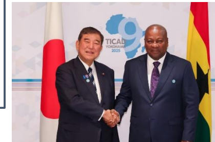
Japan-Ghana Summit Meeting