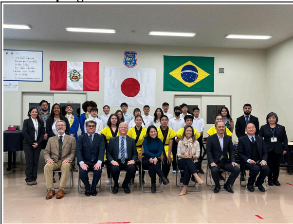
March 23 【Observation】 Mundo de Alegria