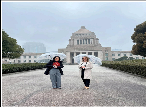
March 25 【Observation】 National Diet Building