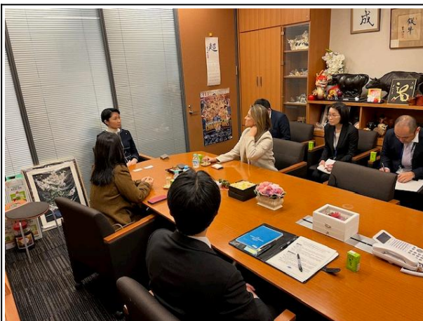
March 27 【Courtesy call】 Ms. Yuko Obuchi, Vice-Presidente do Grupo Parlamentar Japão-Brasil