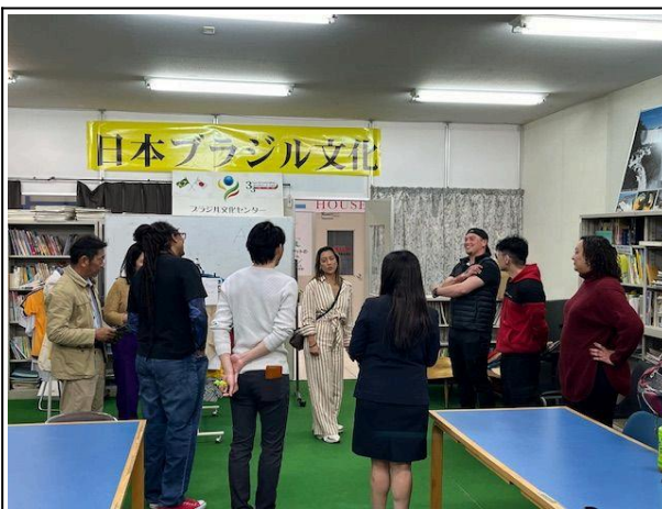
March 24 【Observation】 Brazilian Plaza