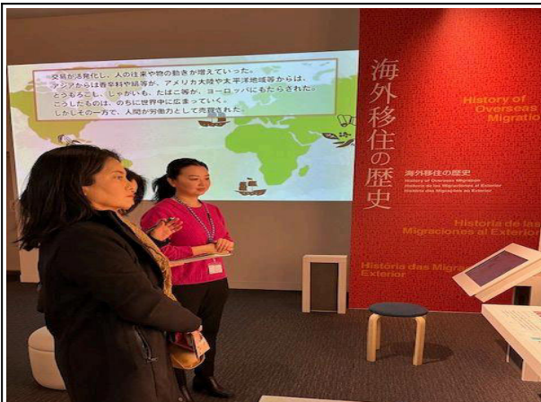
March 26 【Observation】 Japanese Overseas Migration Museum