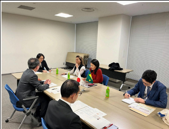
March 25 【Exchange】 Japan Tourism Agency