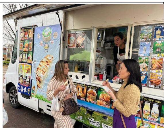
March 24 【Exchange】 International festival