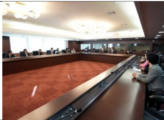
Feb 13 【Courtesy call】