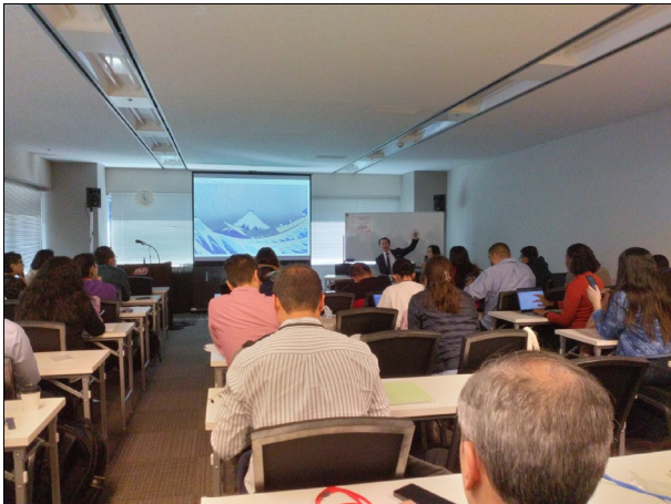
Feb 12 【Ukiyoe lecture】