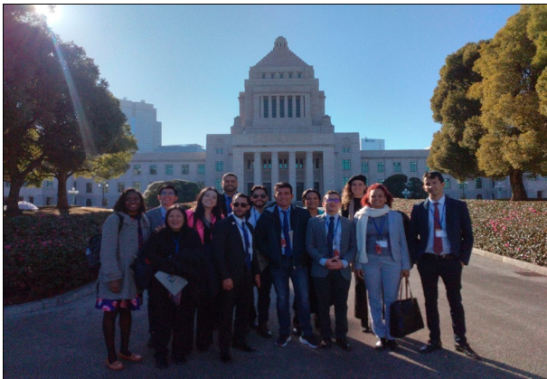
Feb 13 【Observation】 House of parliament