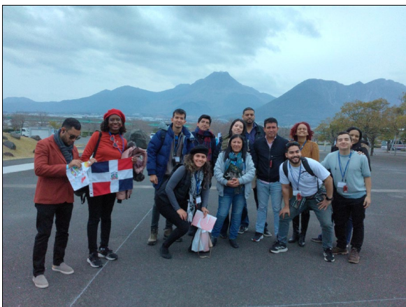
Feb 14 【Theme related observation】 Unzen (volcano museum)