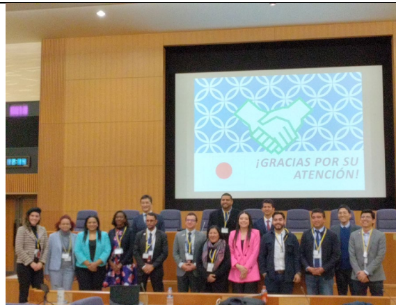
Feb 13 【Theme related lecture】 MOFA