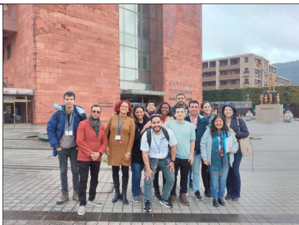
Feb 14 【Observation】 Peace study in Nagasaki