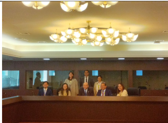
Feb 13 【Courtesy call】