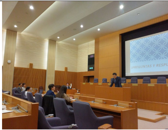
Feb 13 【Theme related lecture】 MOFA