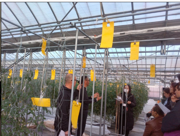
Feb 14 【Lecture & Observation】 Awaji Island