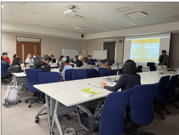
Feb 14 【Lecture】 Kobe University