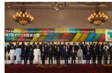
TICAD 7(2019) Yokohama