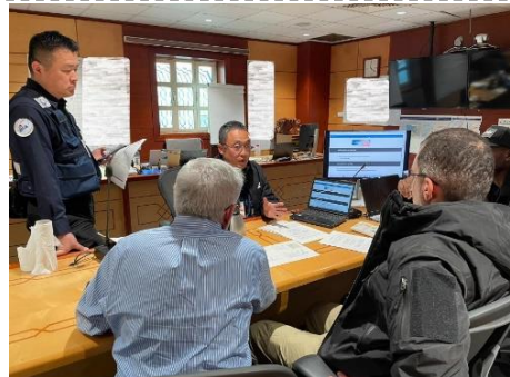
Briefing of Info management method on stakeholders by JICA specialists.

Within this project, Japan will support hospitals in 9 governorates in Egypt which accept seriously injured patients and newborns from Gaza by providing medical supplies and equipment, technical support and training for capacity building of hospitals and medical staff, and additional support for risk communication and community engagement among the governorates.