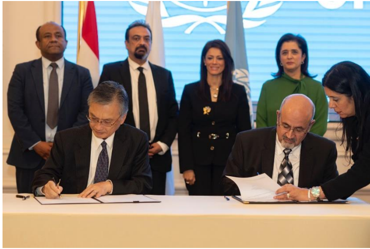
On March 10 th 2024, the Embassy of Japan in Egypt and WHO signed an exchange of notes for “the Project for Medical Emergency Support to the Hospitals Affected by the Situation in the Gaza Strip” in Cairo to provide assistance to Egyptian hospitals.