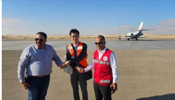
Japan and Egyptian Red Crescent hand-in-hand extend support to people in Gaza.