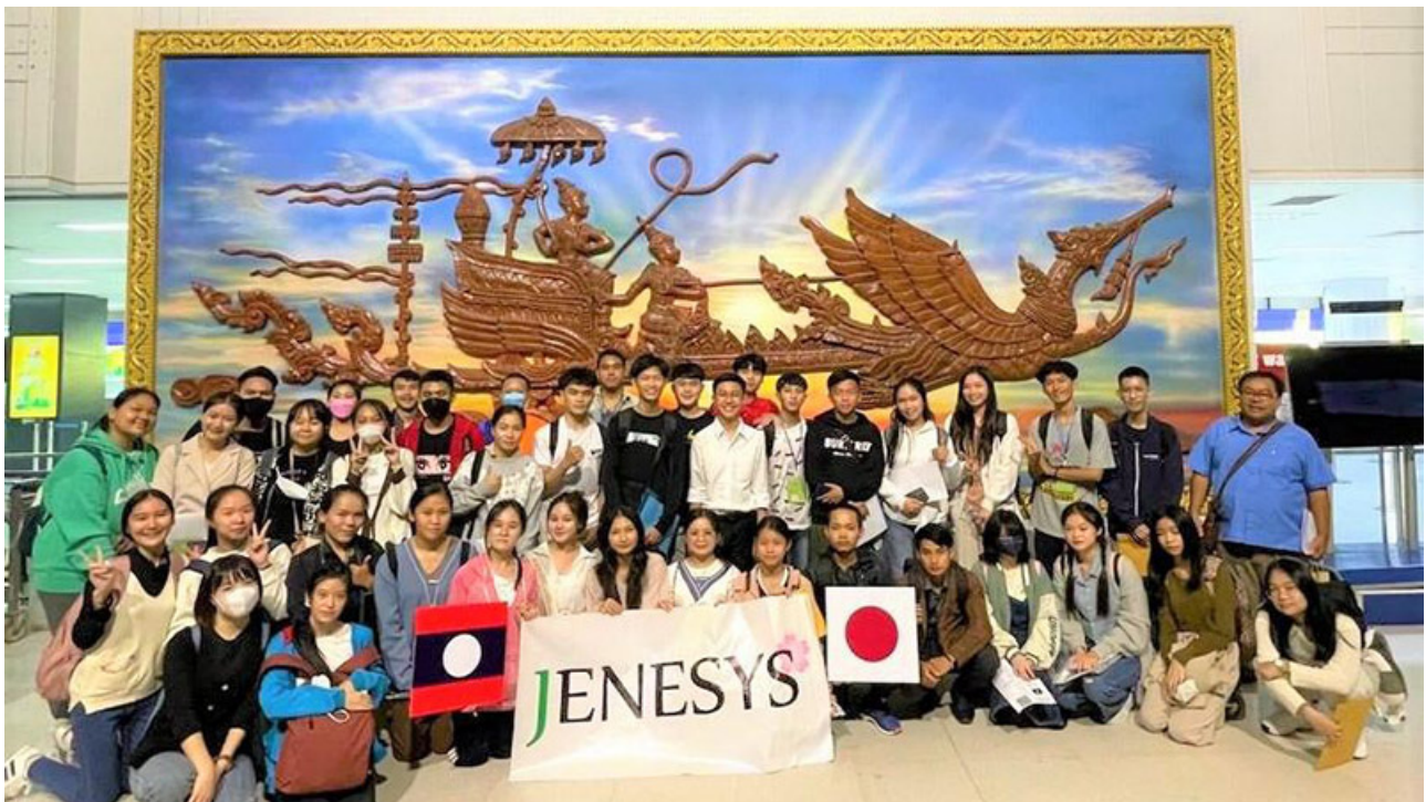
More than 2,200 Lao young people have been to Japan for exchanges since JENESYS's establishment in 2007.

This year marks the 50th Year of Asean-Japan Friendship and Cooperation. In December, when the buds are unfurling on the Japanese cherry blossom trees in the Laos-Japan Friendship Sakura Park in Huaphan province, The Commemorative Summit for the 50th Year of Asean-Japan Friendship and Cooperation will be held in Tokyo. Japan has supported Asean countries' development while standing by Asean for a long time and deepened the relationship of mutual trust. We regard the Commemorative Summit meeting as an invaluable opportunity for Japan and Asean to jointly set out the direction of the future of Asean-Japan relations and new visions for cooperation looking ahead to shared challenges, based on the valuable asset of cooperation. In addition, Laos will assume the Asean chairmanship next year, and Laos and Japan will celebrate the 70th anniversary of the establishment of diplomatic relations in 2025. We would like to further cooperate with you in order to seize these opportunities to further strengthen the Asean-Japan relationship and also to take our bilateral "strategic partnership" to new heights. As Minister for Foreign Affairs, I will make my utmost efforts to develop friendly relations between our two countries, hand in hand, as reliable partners who will lead the new era. I look forward to working together to create a free and open international order based on the rule of law and a sustainable and prosperous future for the Indo-Pacific and the entire world.