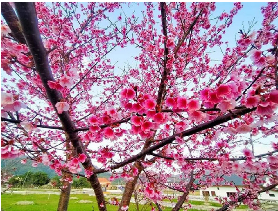
Japanese cherry blossoms (sakura) at the Lao-Japan Friendship Sakura Park in Viengxay district, Huaphan province.