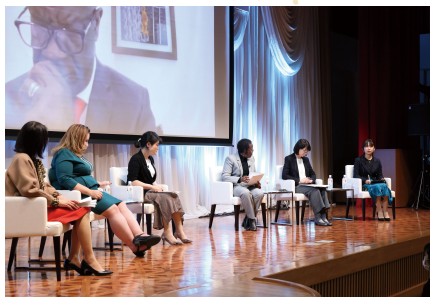
Panel discussion in WAW!2022, Tokyo

Discussions on how to create a better society where gender equality is achieved at the World Assembly for Women: WAW!2022