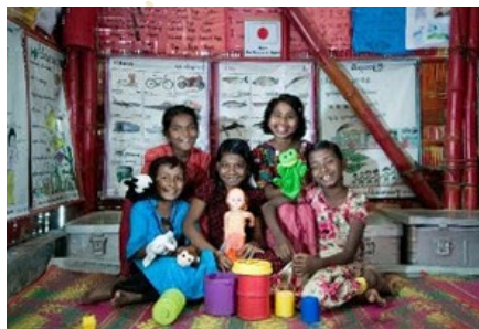
Rohingya children smile during recreation time at Pahartali Learning Centre, Kutupalong refugee camp, supported by the Government of Japan