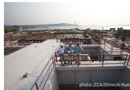
Japanese engineers building a water purification plant in the Democratic Republic of Congo