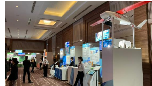
The Exhibition area