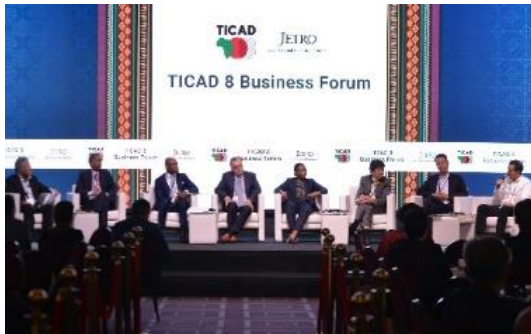
Panel discussion between African and Japanese companies