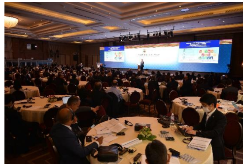
the Business Forum