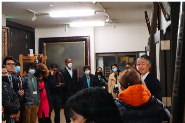
February 13 【Observation】 Curator explains ema at Senso-ji Emado.