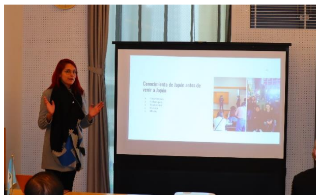
February 13 【Reporting Session】 Presentation of results