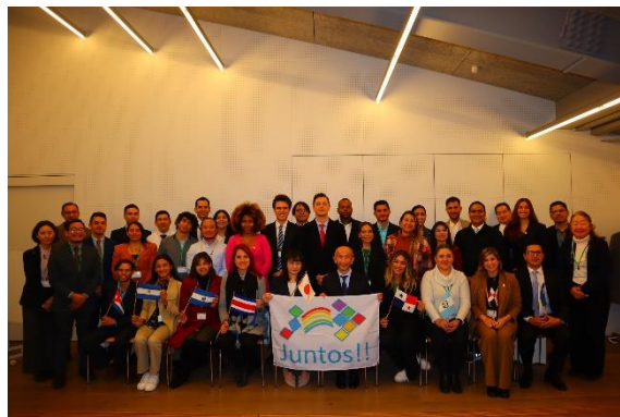
February 13 【Reporting Session】 Group photo