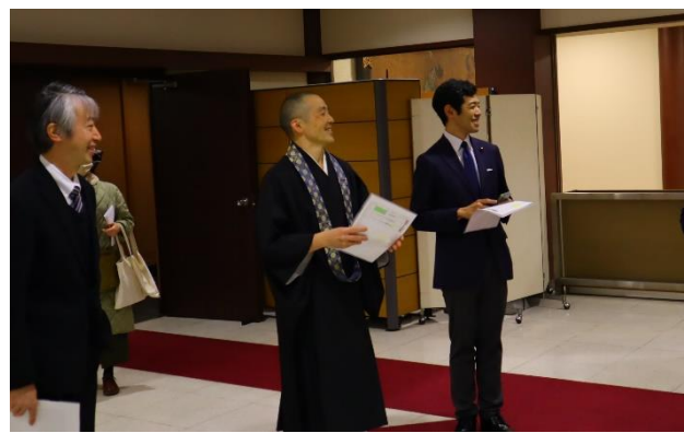
February 13 【Exchange】 Opinion exchange with Mr. TSUJI Kiyoto, Member of the House of Representatives