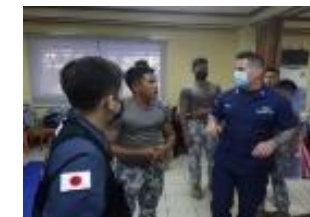
Capacity enhancement support through Japan-U.S. cooperation