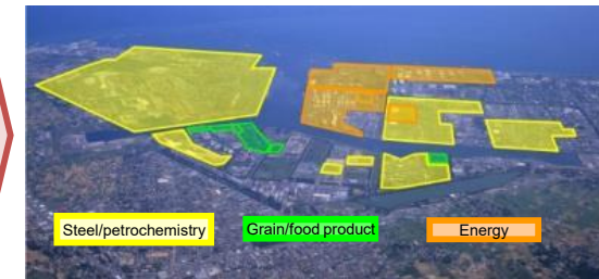
Current Kashima Port