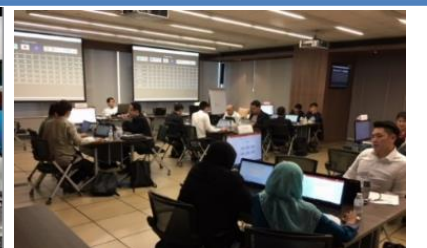
Scene of a cybersecurity exercise [Digitalization of trade procedures]