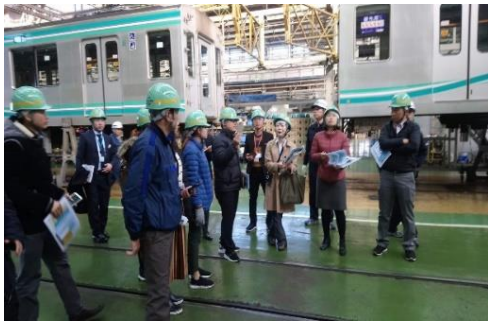
Vietnam: Training in Japan (train maintenance)