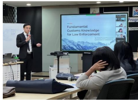
Thailand: Project for strengthening capacity for customs personnel development