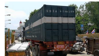
Support for development of a logistics master plan for Cambodia, where many Japanese companies are expanding (Cambodia)