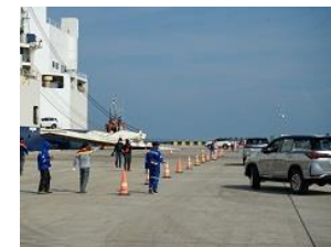
Patimban Port Development Project for automobile project (yen loan) (Indonesia)