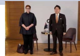
Issuance of a joint statement by Japan, the U.S., Australia, Micronesia, Kiribati, and Nauru on improving East Micronesia telecommunications connectivity (December 2009).