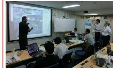
Technical cooperation on the use of observation data obtained by the weather satellite Himawari