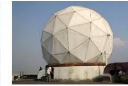
Bangladesh: Improvement of the meteorological radar system