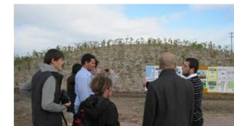
Asian Disaster Reduction Center Visiting research fellows (Affected area of the Great East Japan Earthquake)