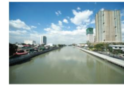
Philippines: River improvement