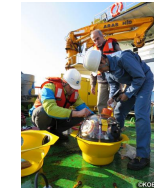
Turkish: Disaster risk reduction education project