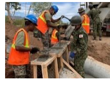
Timor-Leste: Civil engineering

Structural and nonstructural support for the Pacific, ASEAN, and Indian Ocean regions