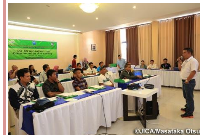
Orientation toward peace, held by the Bangsamoro Transition Commission (Philippines)