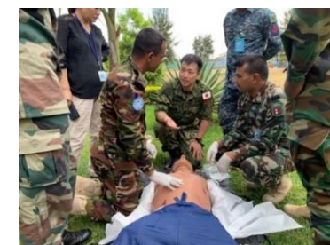
Engineering and medical trainings