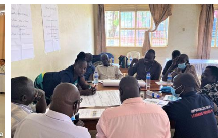
Planning for emergency assistance and independence support of refugees (Uganda)