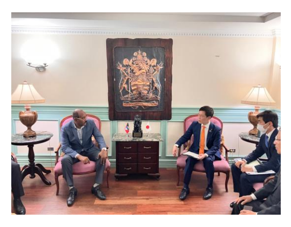
Mr. AKIMOTO Masatoshi, Parliamentary Vice-Minister for Foreign Affairs of Japan meets with The Honourable Gaston BROWNE, Prime Minister of Antigua and Barbuda

4. Under this commitment, the Ministries of Foreign Affairs of both countries will engage in extensive discussions to expand and deepen the exchanges, cooperation and friendship ties between the two countries in a wide range of areas, including cultural, educational and academic exchanges, economic cooperation as well as cooperation in the international arena.