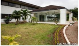
Noguchi Memorial Institute for Medical Research in Ghana

Japan (JICA) established an institute as a core research center in Ghana, and has provided technical cooperation and grant aid for the past 50 years. The institute is promoting joint research with other institutes inside and outside of the country. The institute conducts approximately 20,000 PCR tests per week for COVID-19, comprising 80 percent of all testing in Ghana. It also forms a network in 9 countries including Ghana to provide technical support to testing systems , as well as enhancing the research and early-warning systems.