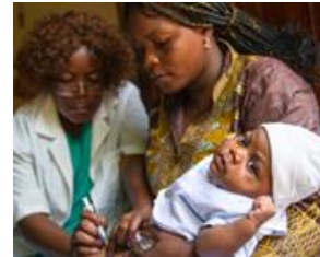
Vaccination by medical staff

※AMC accelerates manufacturing and supply of vaccines to lower income countries by guaranteeing a minimum amount of purchases from partnering manufacturers.