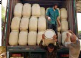
Distribution of chlorine for sterilizing tap water (Tajikistan)

Japan provided various equipment such as water-purifying reagents, fuel for water tankers, water pipes, and PPE to water utility workers in more than 15 countries . In addition, Japan has conducted training and awareness raising campaigns on hand-washing at field sites, which have contributed to promoting health and preventing disease.