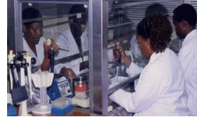
Human resources development including researchers for nearly 50 years at the institute