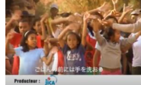
Awareness Campaign video of hand-washing created by Japan Overseas Cooperation Volunteers (Madagascar)

In response to the deteriorating situation of malnutrition and growth-stunting caused by interruptions in the food supply, Japan (JICA) is implementing cross-sectoral measures to improve nutrition under the “Initiative for Food and Nutrition Security in Africa (IFNA)” in 12 African countries . Japan will host the Tokyo Nutrition for Growth Summit in December 2021 for global commitment and actions.