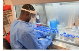
Staff conducting a PCR test at the institute