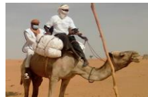
Delivering equipment (the Global Fund)

Japan has provided necessary equipment for immigration control such as masks, gloves, thermometers and antiseptics for 5 countries in Central Asia. In Tonga, thermography and other tools were provided to strengthen quarantine capacity.