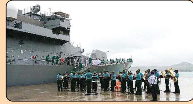
PNG Military Band performing for goodwill port call of Japan Maritime Defense Force ship Sazanami , September 20, 2018