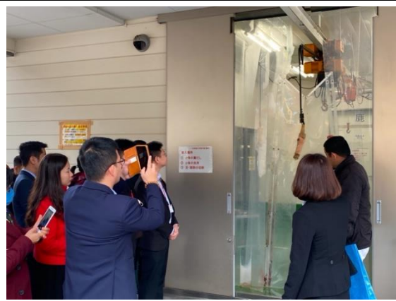
February 14th 【Observation】 Mimasaka Meat Processing Facility