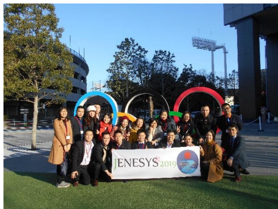
February 12th 【Observation】 Japan Olympic Museum