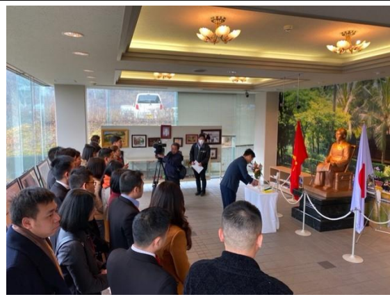
February 14th 【Observation】 Ho Chi Minh Statue