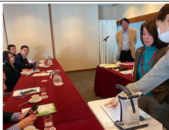
February 18th 【Company Visit】 Nippon Telesoft, Co., Ltd