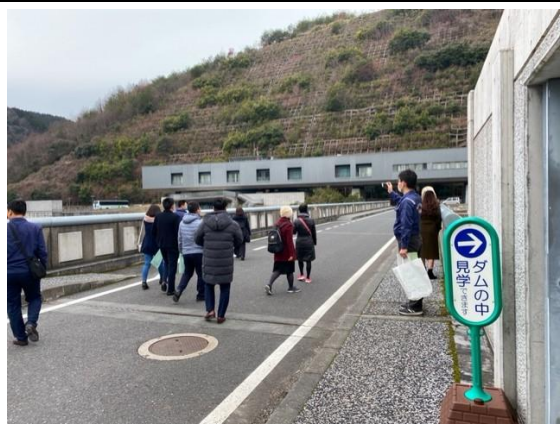
February 15th 【Observation】 Tomata Dam