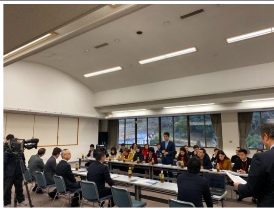
February 14th 【Courtesy Call】 Okayama Prefecture Mimasaka City Office