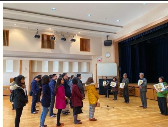
February 15th 【Home-stay】 Okayama, Kibi-chuo Town