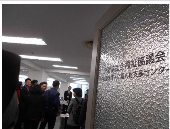
February 13th 【Observation】 Chiba Foreign Care Workers (Human Resources) Support Center