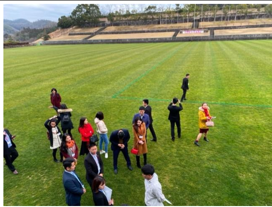
February 14th 【Observation】 Olympics・Paralympics Facilities