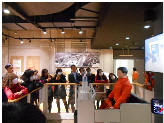
February 13th 【Observation】 The Tokyo Rinkai Disaster Prevention Park (SONA AREA Tokyo)