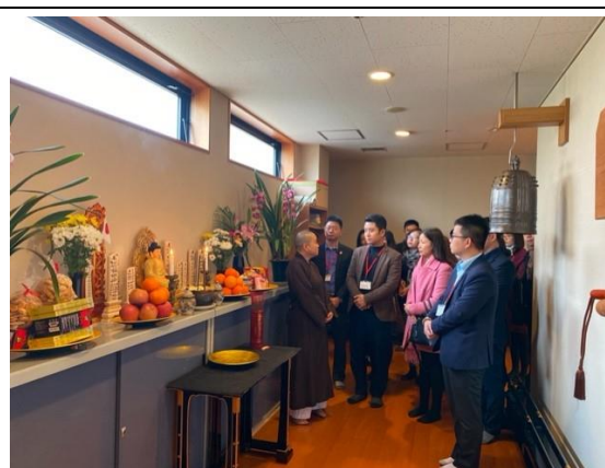
February 17th 【Observation】 Nisshinkutsu