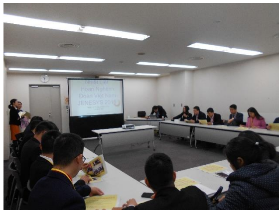
February 12th 【Orientation】