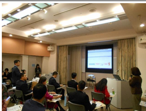
February 13th 【Courtesy Call】 Chiba Prefectural Government Office