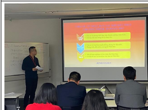
February 19th 【Reporting Session】