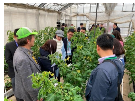
February 17th 【Observation】 Japan Plant Factory Association (JPFA)