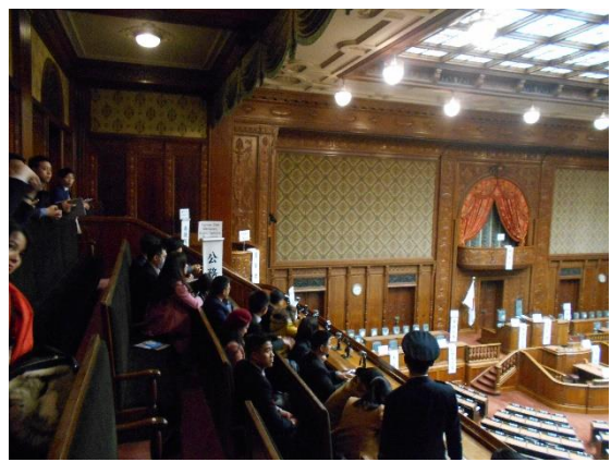
February 12th 【Observation】 The National Diet