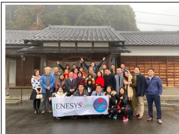
February 16th 【Home-stay】 Okayama, Kibi-chuo Town